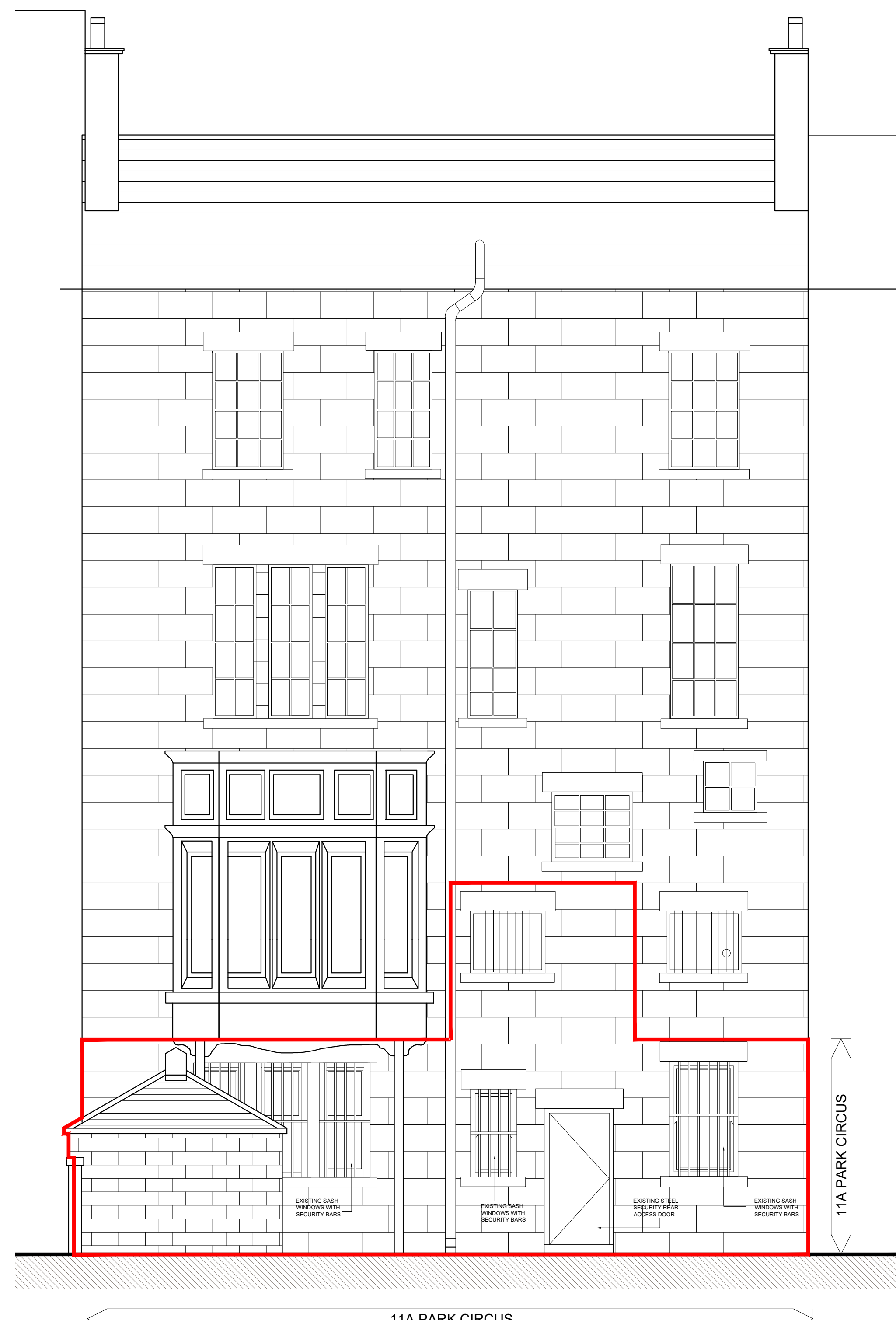
1 11A EXISTING LOWER GROUND FLOOR - REAR ELEVATION