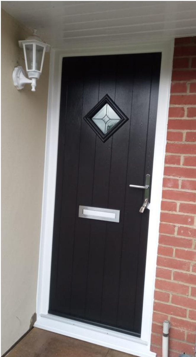
A black, timber composite door with a diamond shaped glass window