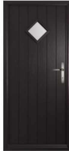
A black, timber composite door with a diamond shaped glass window – no glass feature