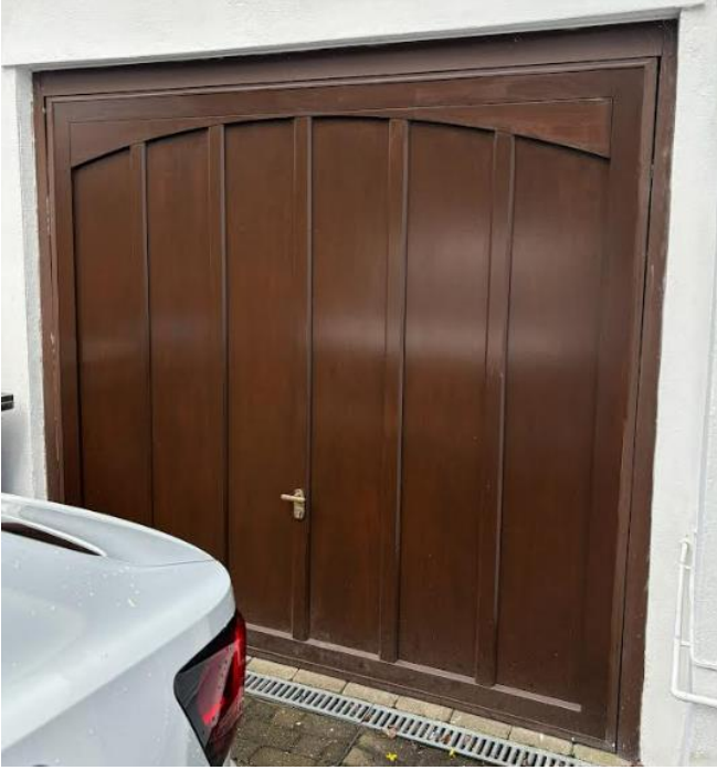
Existing Garage Door: Dark Brown Timber Door