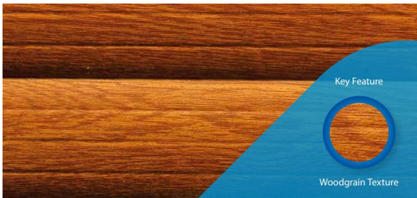
Example woodgrain effect – proposed installation in black