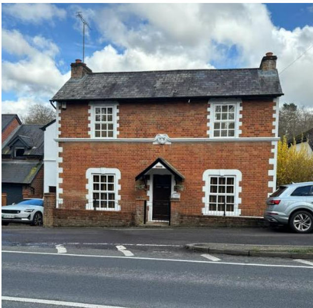
House: Front view