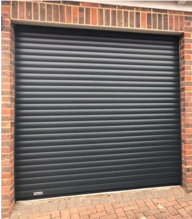
A black, aluminium, electric roller door.