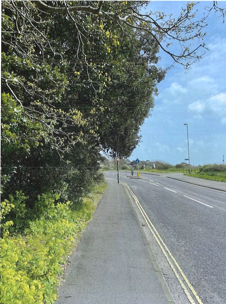
Image 3: Group 1 low trees and under-storey vegetation Stokes Bay Rd leading to roundabout junction with Anglesey Rd

SAFETY IS NO ACCIDENT: IF IN DOUBT, SPEAK UP. A RISK ASSESSMENT MUST BE CARRIED OUT BY ALL STAFF FOR ALL ELEMENTS OF WORK COVERED BY THIS SPECIFICATION.