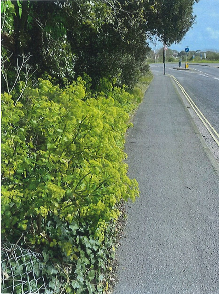
Image 4: Group 1 under-storey vegetation Stokes Bay Rd leading to roundabout junction with Anglesey Rd

SAFETY IS NO ACCIDENT: IF IN DOUBT, SPEAK UP.