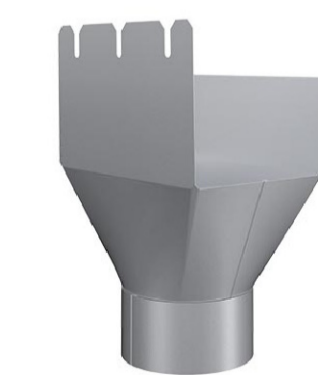
Lindab Guttering Box Gutters