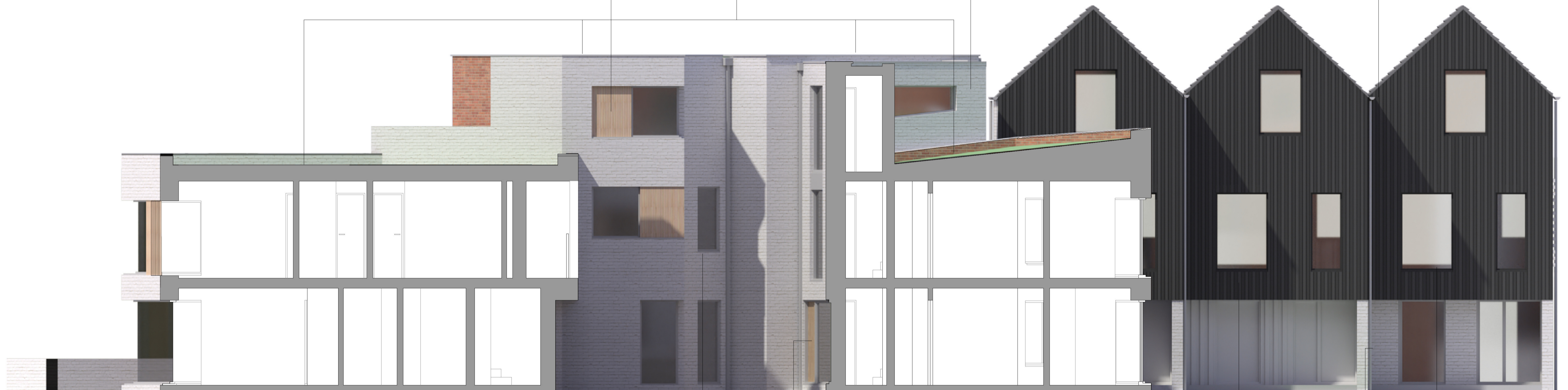
Aluminium Casement Windows with brickwork forming the reveals