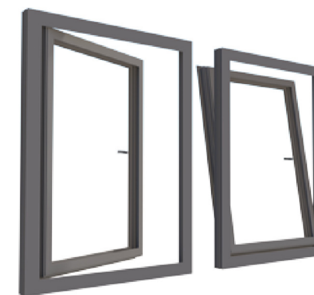
Black Aluminium casement windows. Tilt and turn Windows.