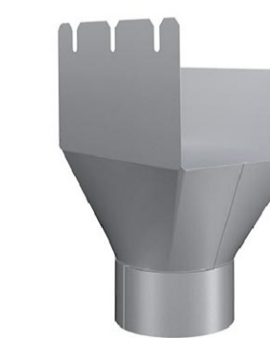
Lindab Guttering Box Gutters