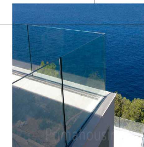
Frameless Glass Balustrade