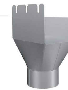
Lindab Guttering Box Gutters