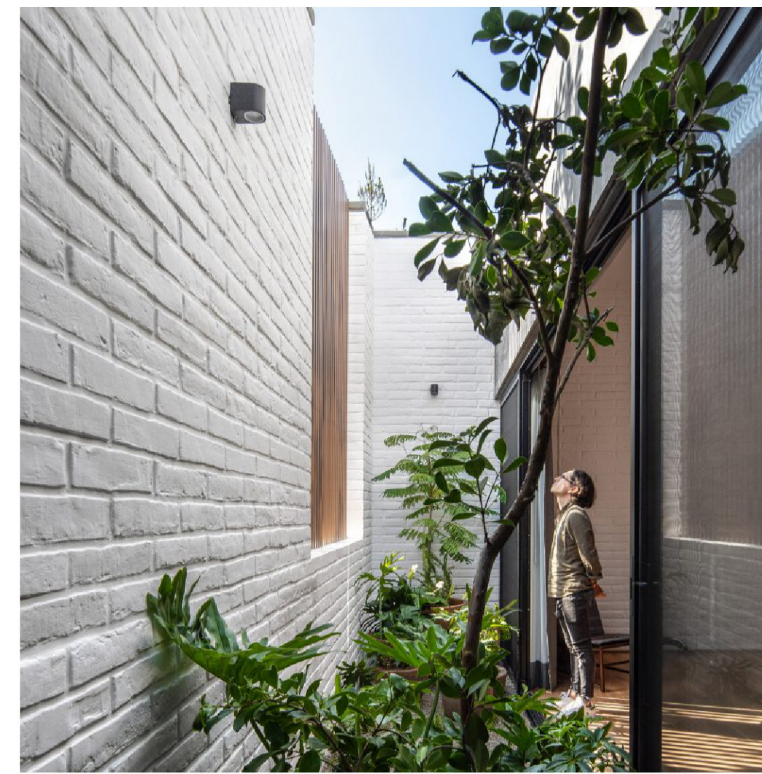
White Painted Brick