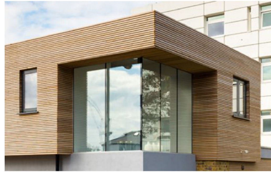
Cedar Cladding western Red Cedar Cladding Battens 19x38mm Vertical