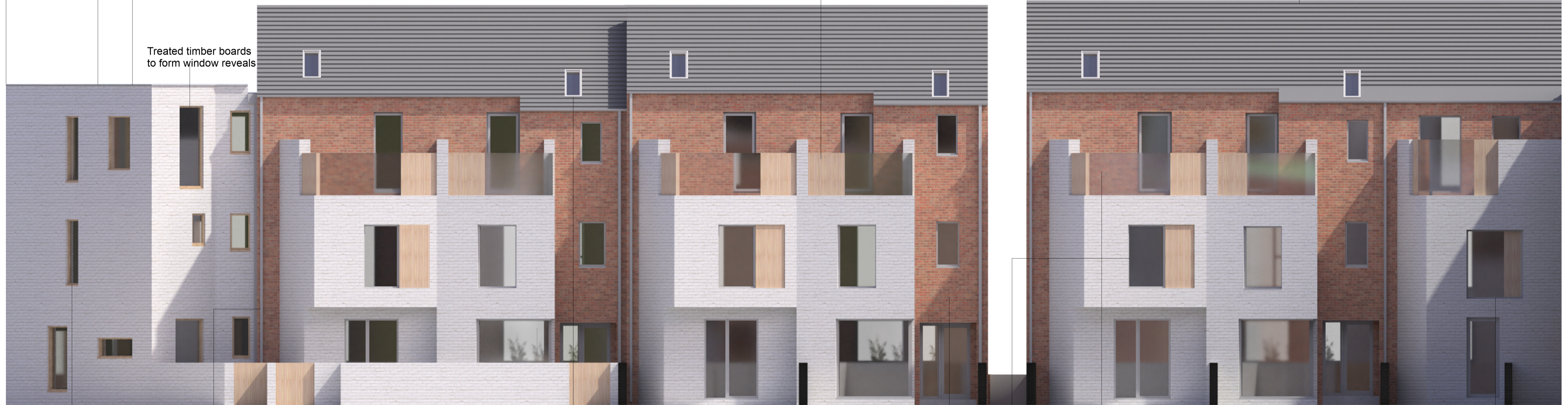
Treated timber boards to form window reveals