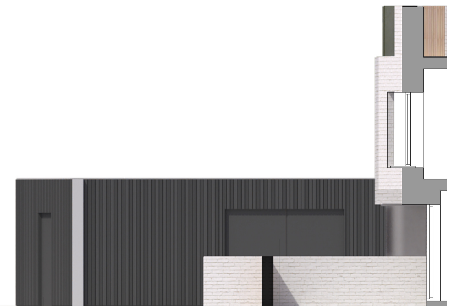
Steel Security Doors