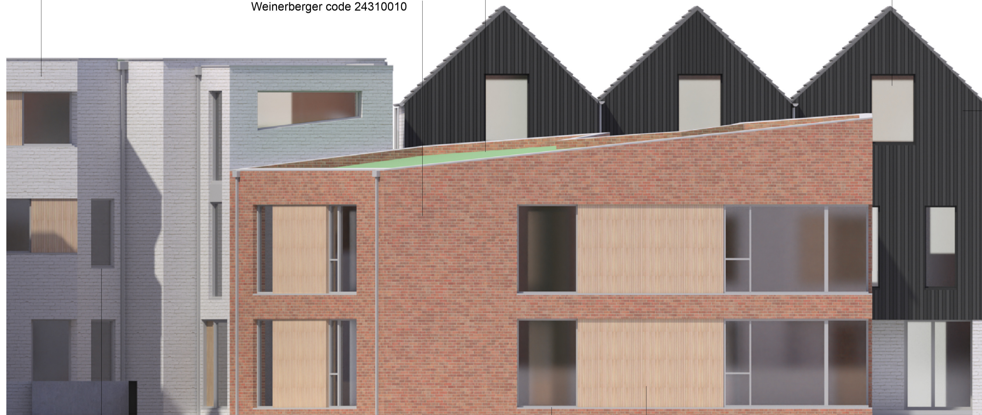
Brick window reveals