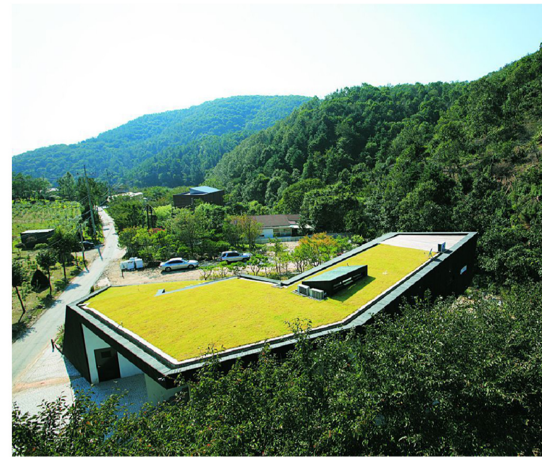
Flat roof - Sloping Sedum Roof