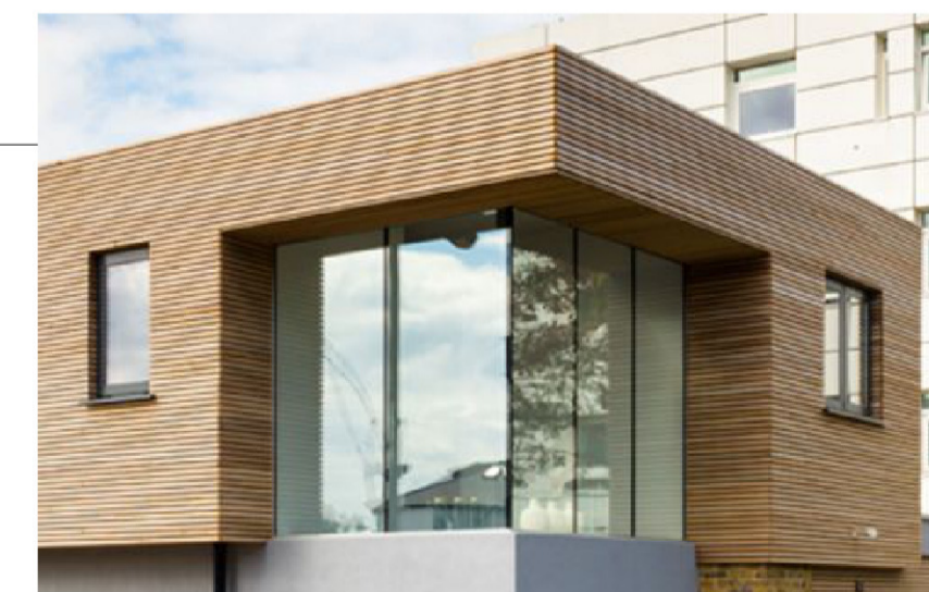
Cedar Cladding western Red Cedar Cladding Battens 19x38mm Vertical