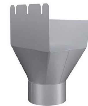
Brick window reveals