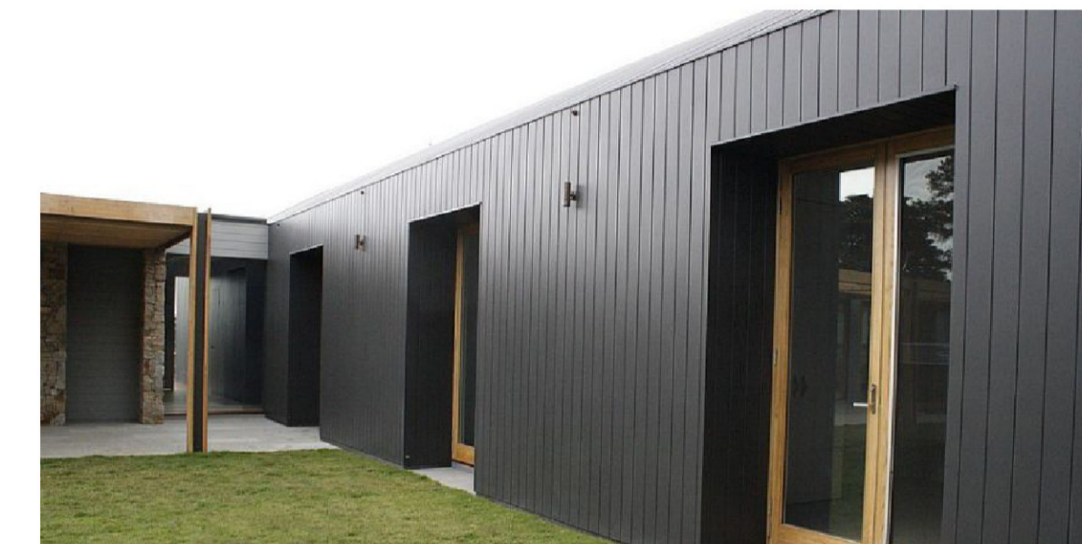
Black Composite Cladding Manufacturer - Cedral click Black C50