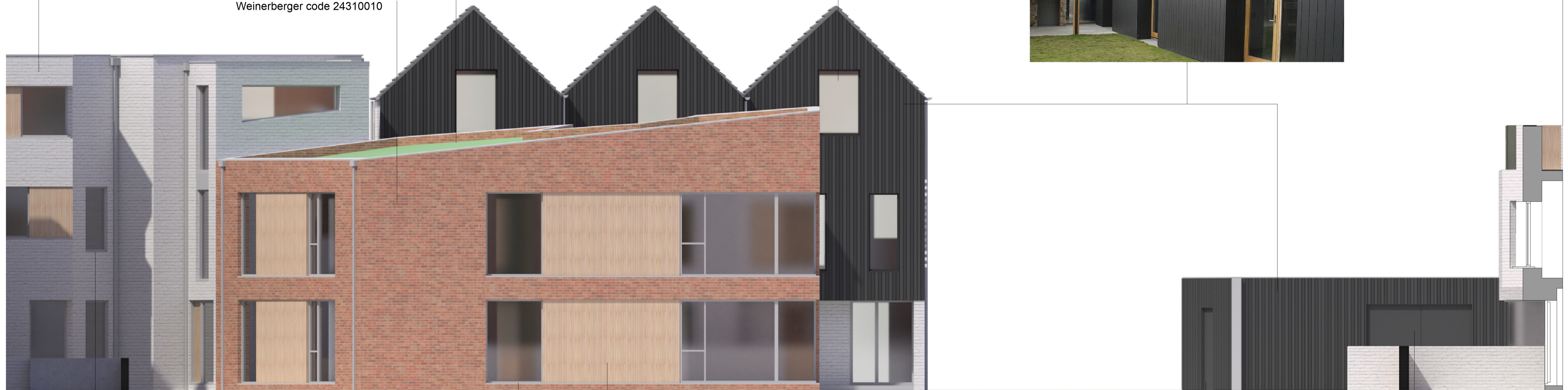
Brick window reveals