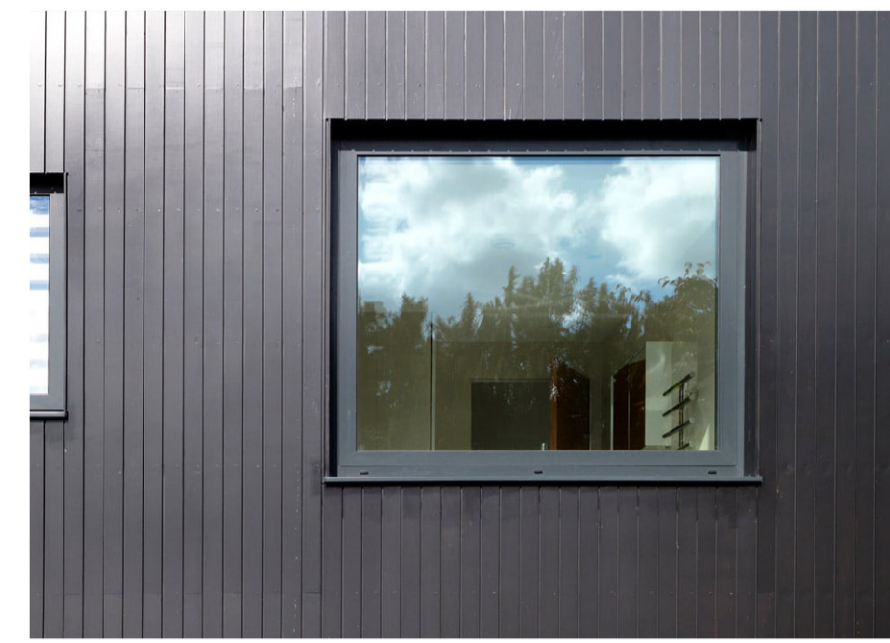
Black Aluminium windows