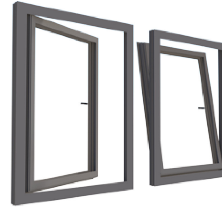
Black Aluminium tilt and turn windows