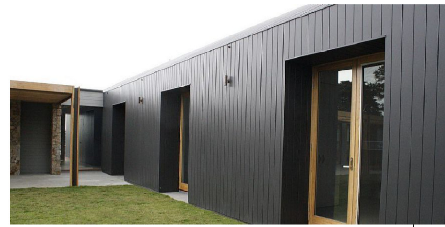
Black composite cladding