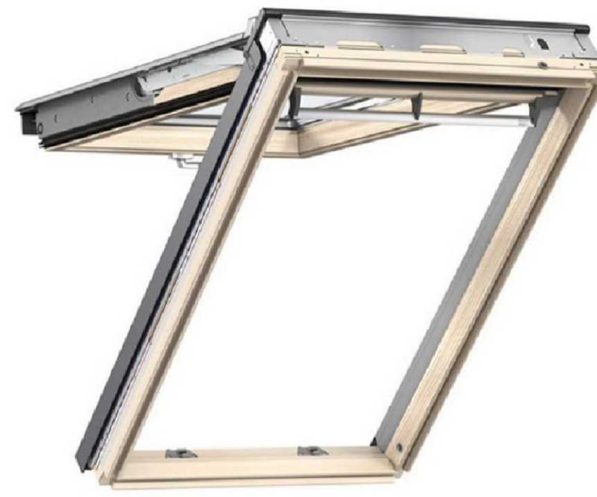
Top Hung Velux Roof Light