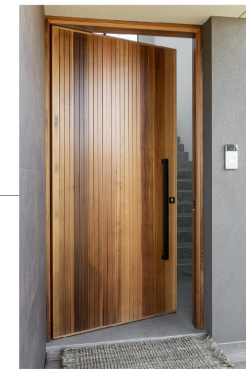
Timber multilock front doors

Window Reveal to consist of black composite cladding on either side and above the window frame to fit flush with the window, aluminium sill to overhang the cladding.