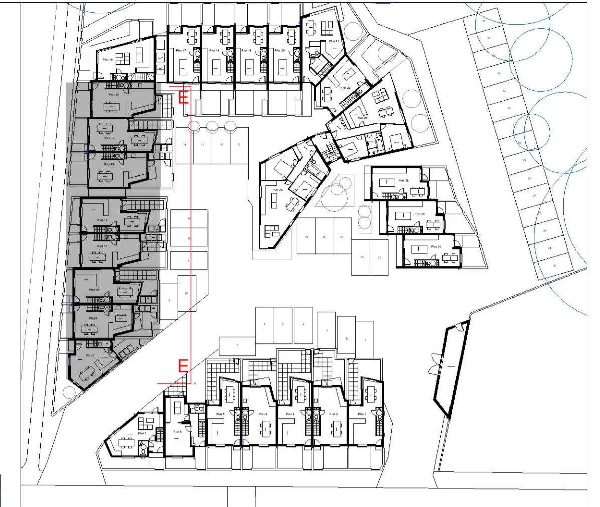
Marley Modern Flat Profile Concrete Interlocking roof tile