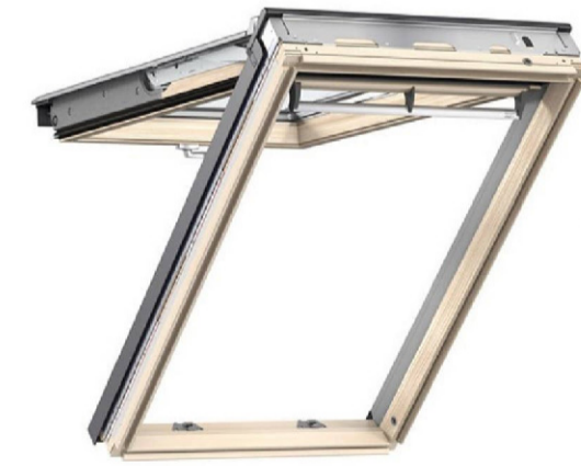
Top Hung Velux Roof Light