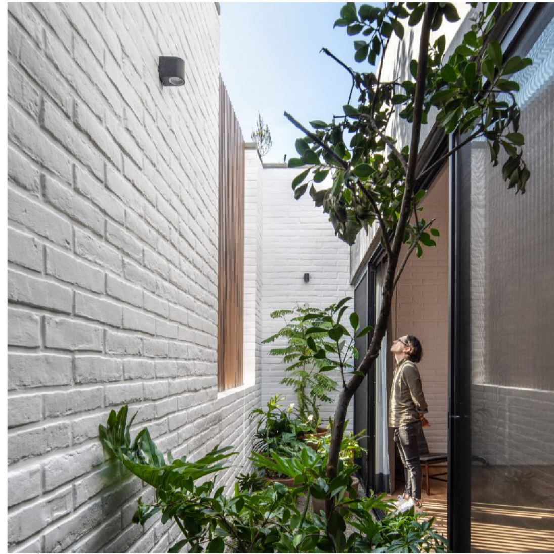
White Painted Brick