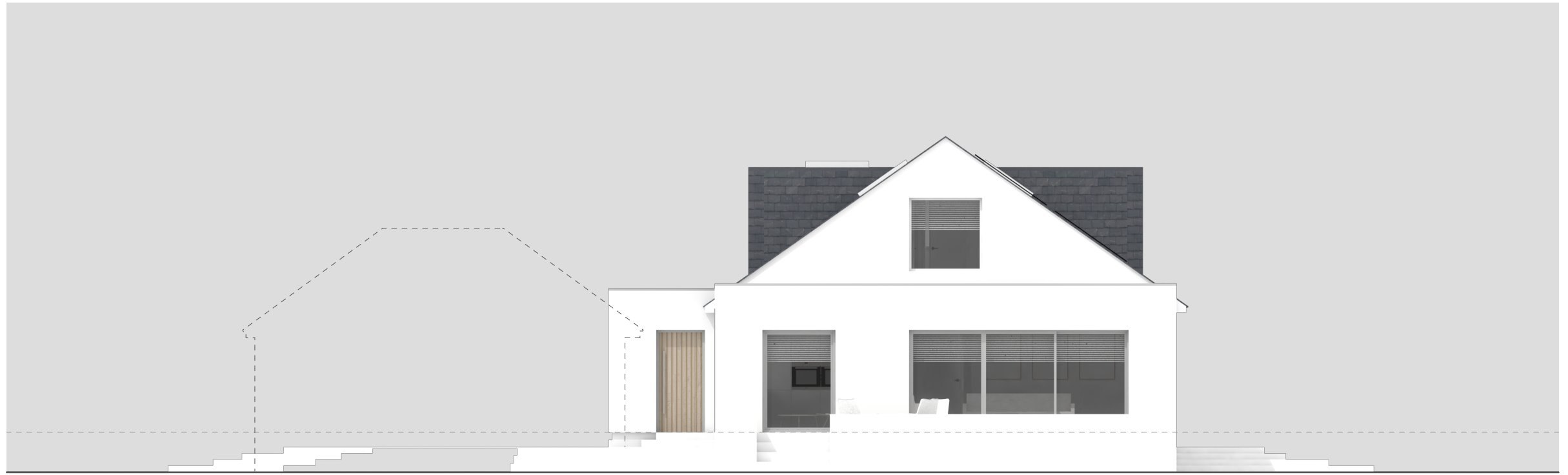
001 | rear / south east elevation [dashed line indicates outline of annexe]