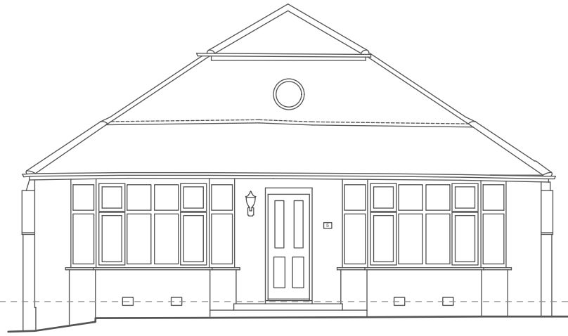
001 | front / north west elevation