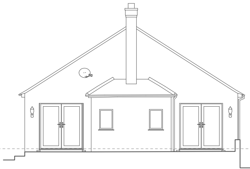
003 | rear / south east elevation