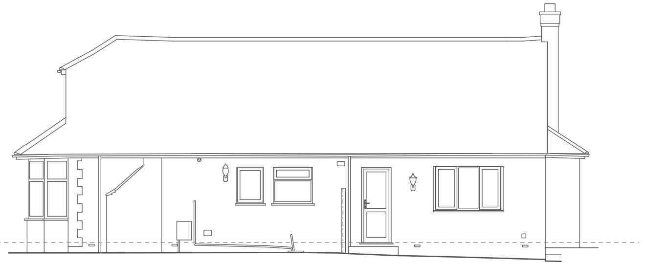
002 | side / south west elevation