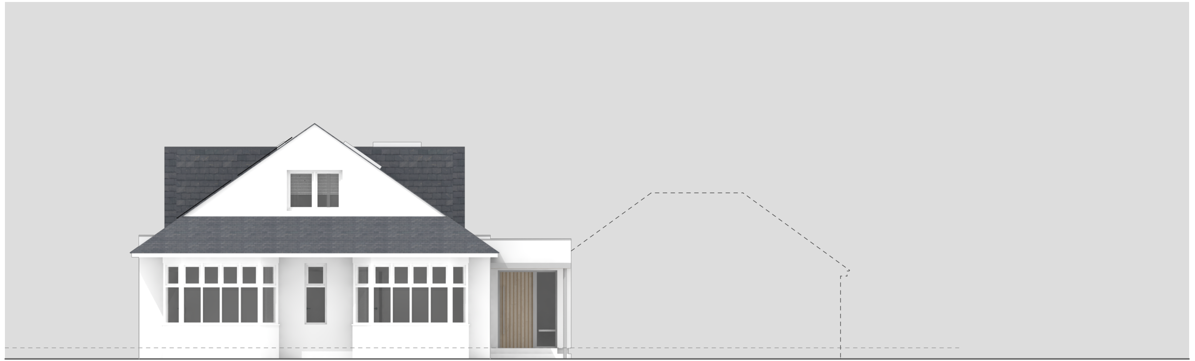
001 | front / north west elevation [dashed line indicates outline of annexe]