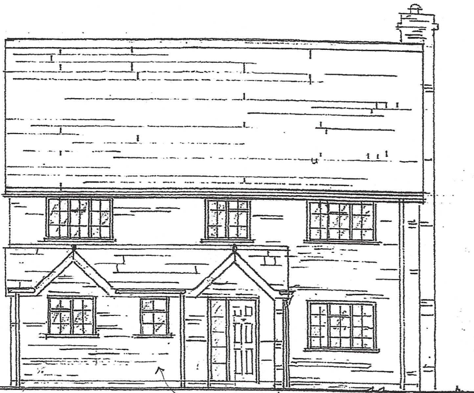
Proposed west elevation