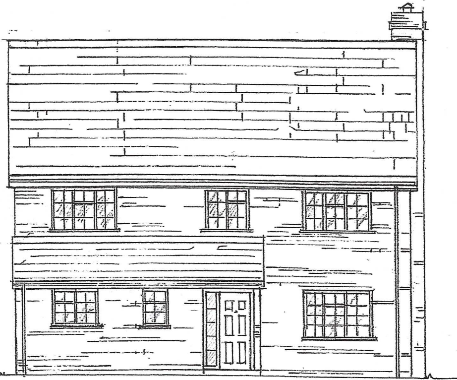
Existing west elevation