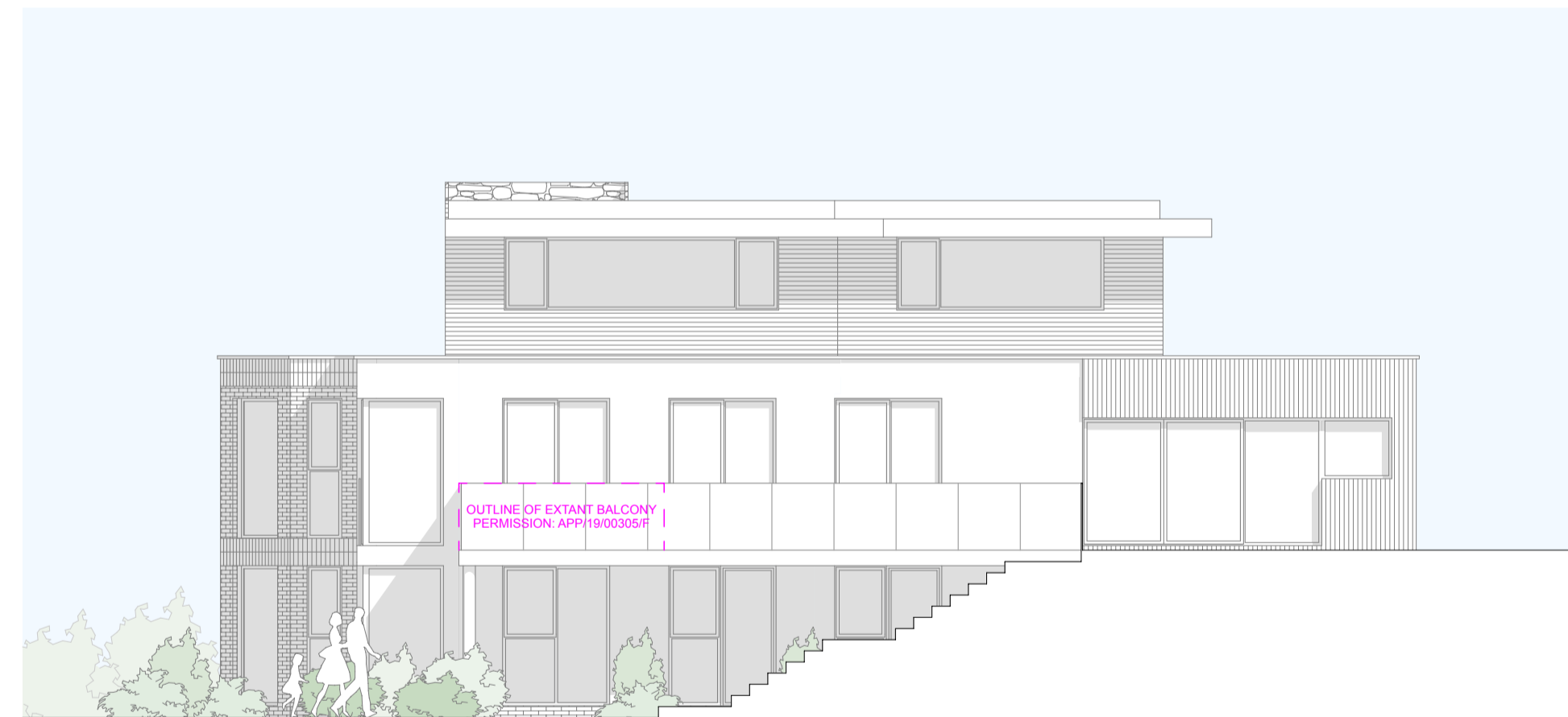
Proposed Rear Elevation Scale (A1): 1:100