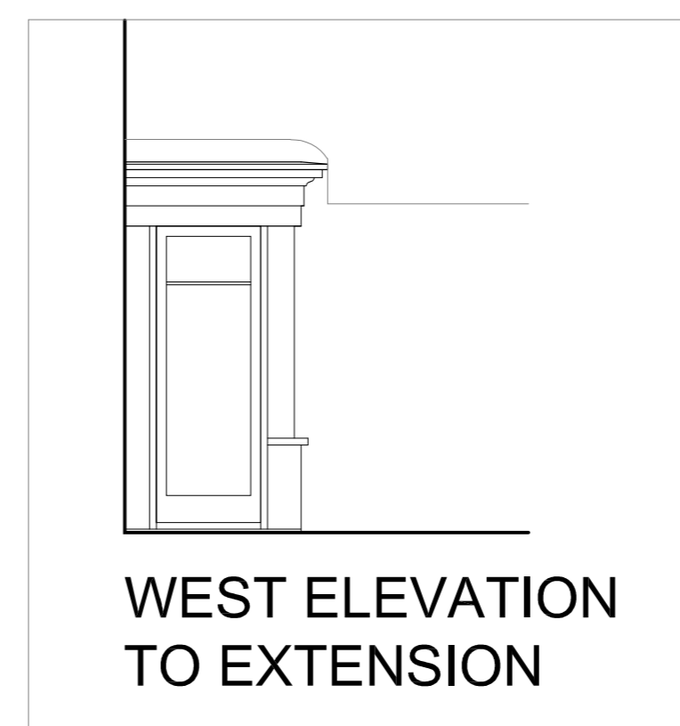
WEST ELEVATION TO EXTENSION