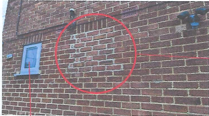
Existing wall, showing downstairs toilet window to the left, and new brickwork (circled) where the original window was formerly located