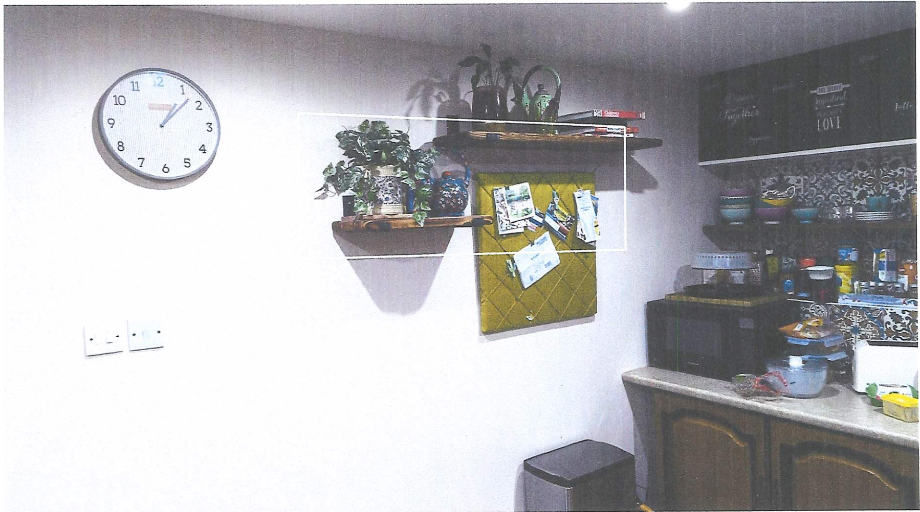
Interior of kitchen, white lines showing proposed window position. Original window was above the microwave position, to the right. Window would be 1.5 metres above the floor level.