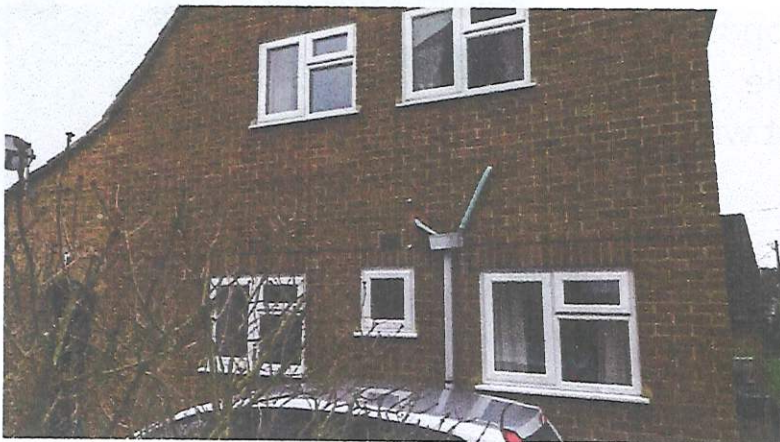
Opposite wall of neighbouring house