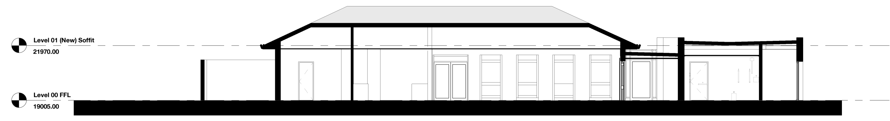
1 GA Section - Section A 1 : 100