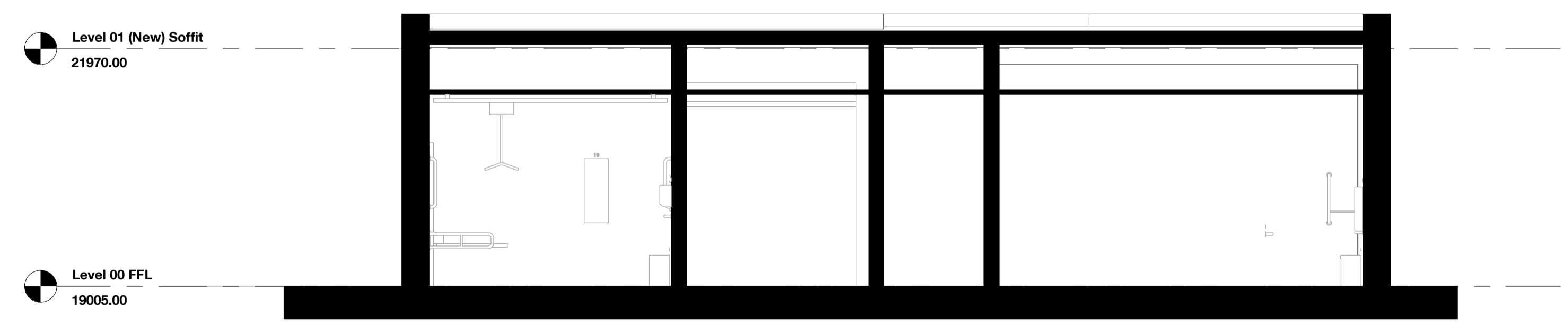
3 GA Section - Section C 1 : 50