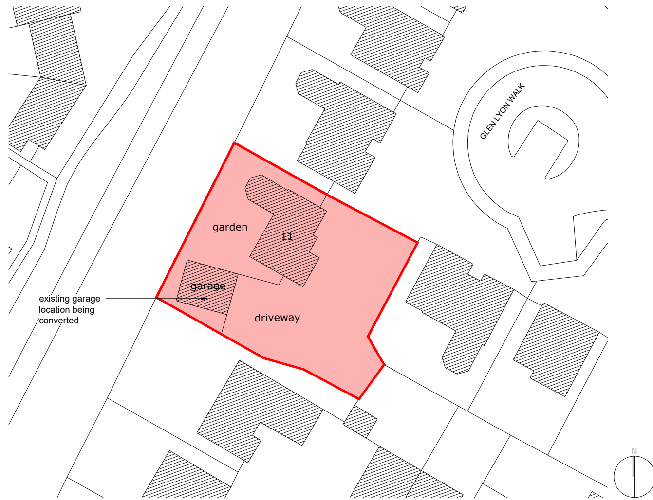
Existing Block Plan 1:500 @ A3