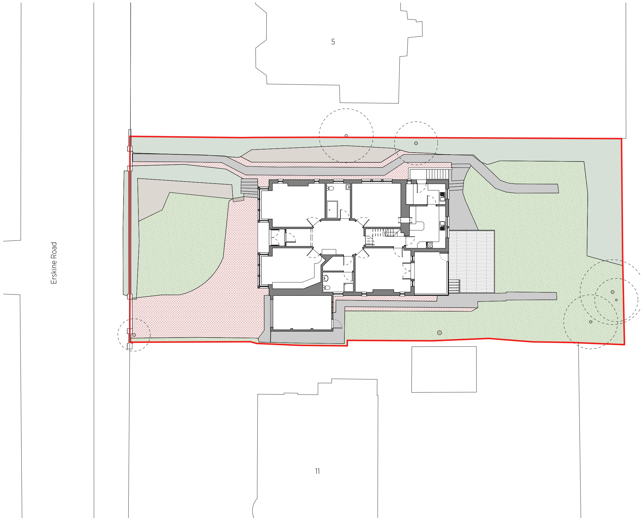
Site Plan as Existing 1:200

Do not scale from drawing. Use figured dimensions only. All dimensions to be checked on site by the contractor and any discrepancies to be notified to the architect prior to works being carried out. Drawing is copyright of NVDC Architects Ltd.