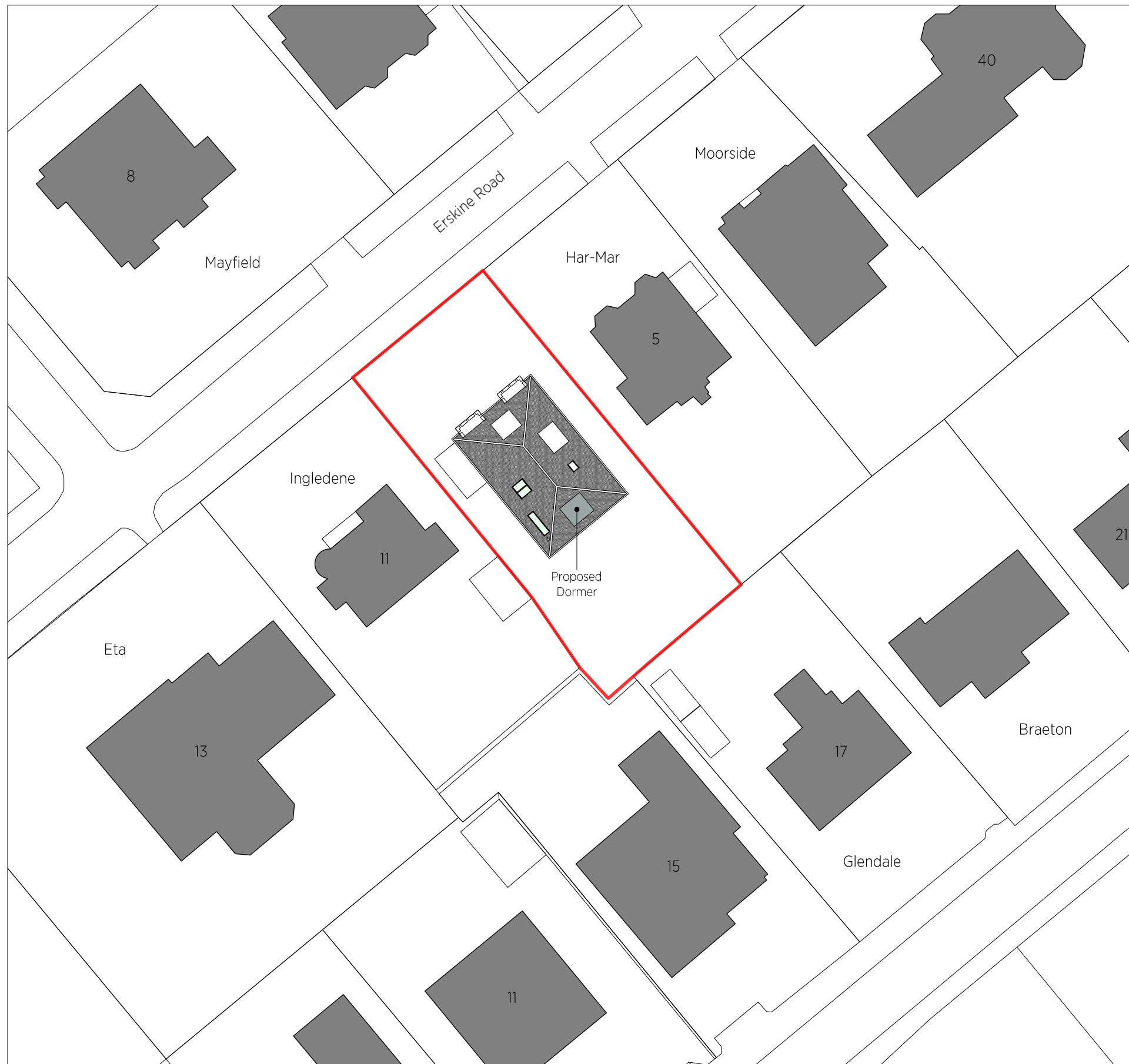
Block Plan as Proposed 1:500

Do not scale from drawing. Use figured dimensions only. All dimensions to be checked on site by the contractor and any discrepancies to be notified to the architect prior to works being carried out. Drawing is copyright of NVDC Architects Ltd.