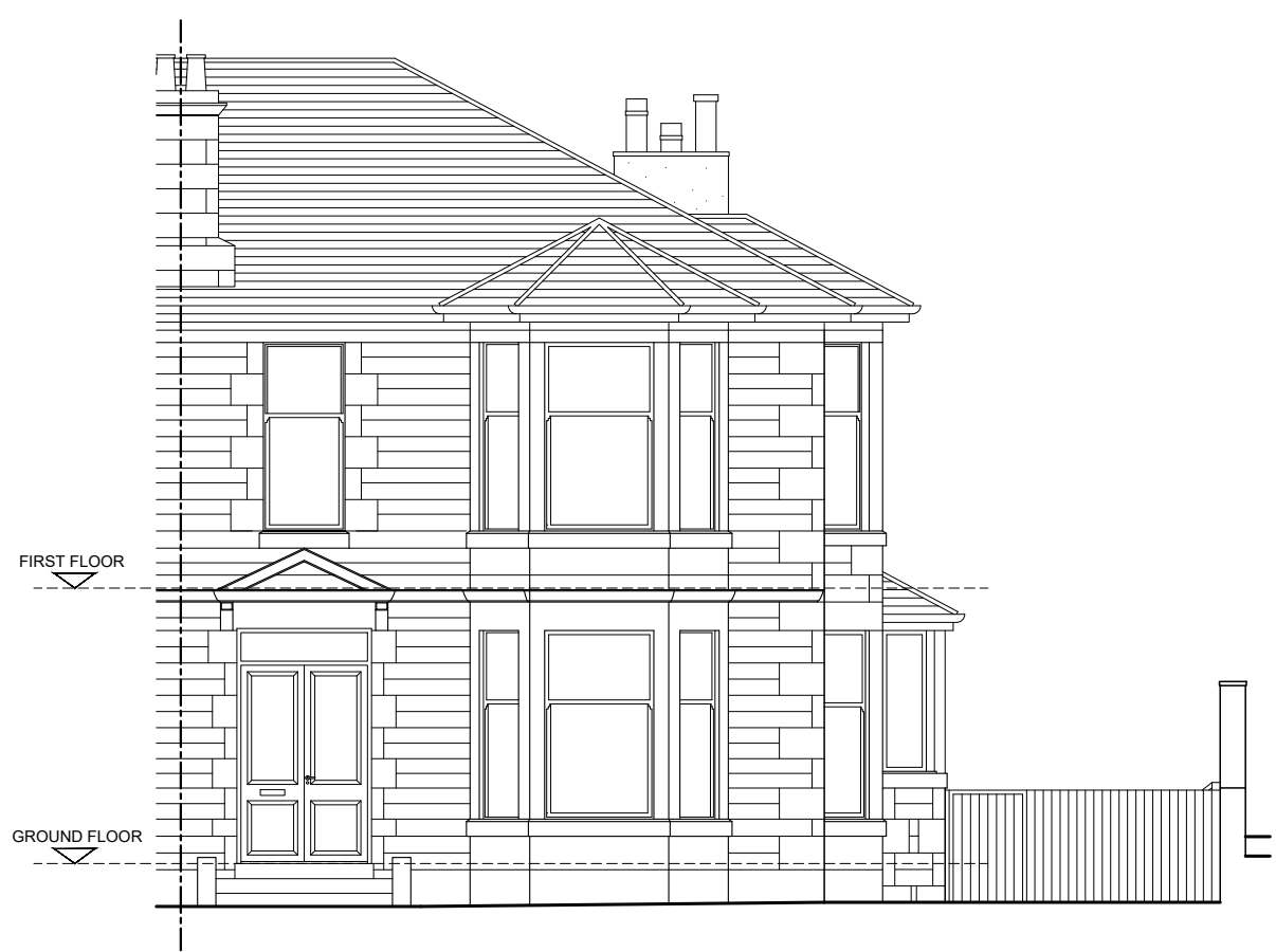
FRONT (NORTH) ELEVATION AS PROPOSED

The use of this data by the recipient acts as an agreement of the following statements. Do not use this data if you do not agree with any of the following statements:- All drawings are based upon site information supplied by third parties and as such their accuracy cannot be guaranteed. All features are approximate and subject to clarification by a detailed topographical survey, statutory service enquiries and confirmation of the legal boundaries. Do not scale the drawing. Use figured dimensions in all cases. Check all dimensions on site. Report any discrepancies in writing to Macdonald Dickson Architecture before proceeding.