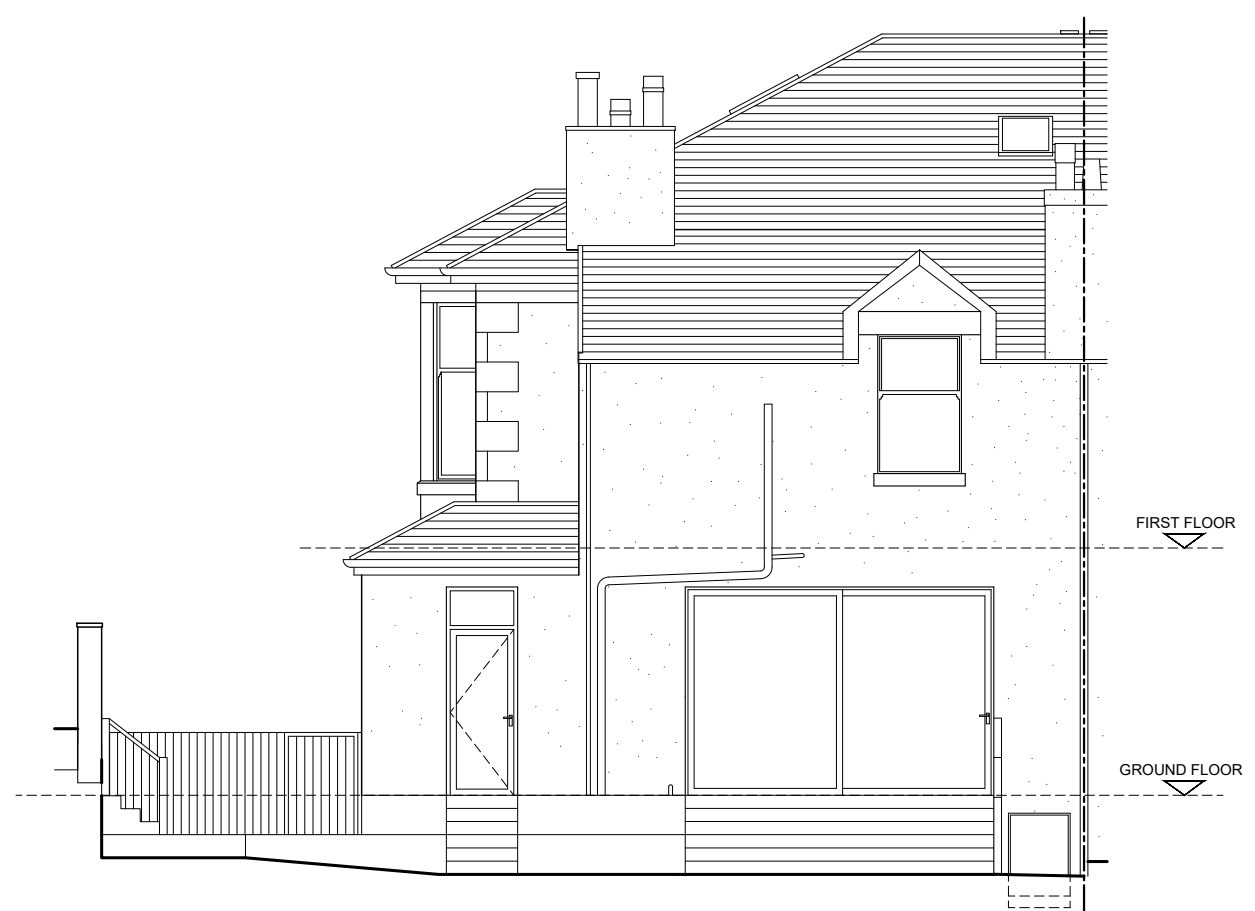
REAR (SOUTH) ELEVATION AS PROPOSED

PROPOSED MATERIALS: WALLS - RED SANDSTONE/ WHITE RENDER TO MATCH EXISTING PITCHED ROOF - SLATE DOORS WINDOWS - ANTHRACITE ALUMINIUM TO REAR ELEVATION/ WHITE UPVC ELSEWHERE