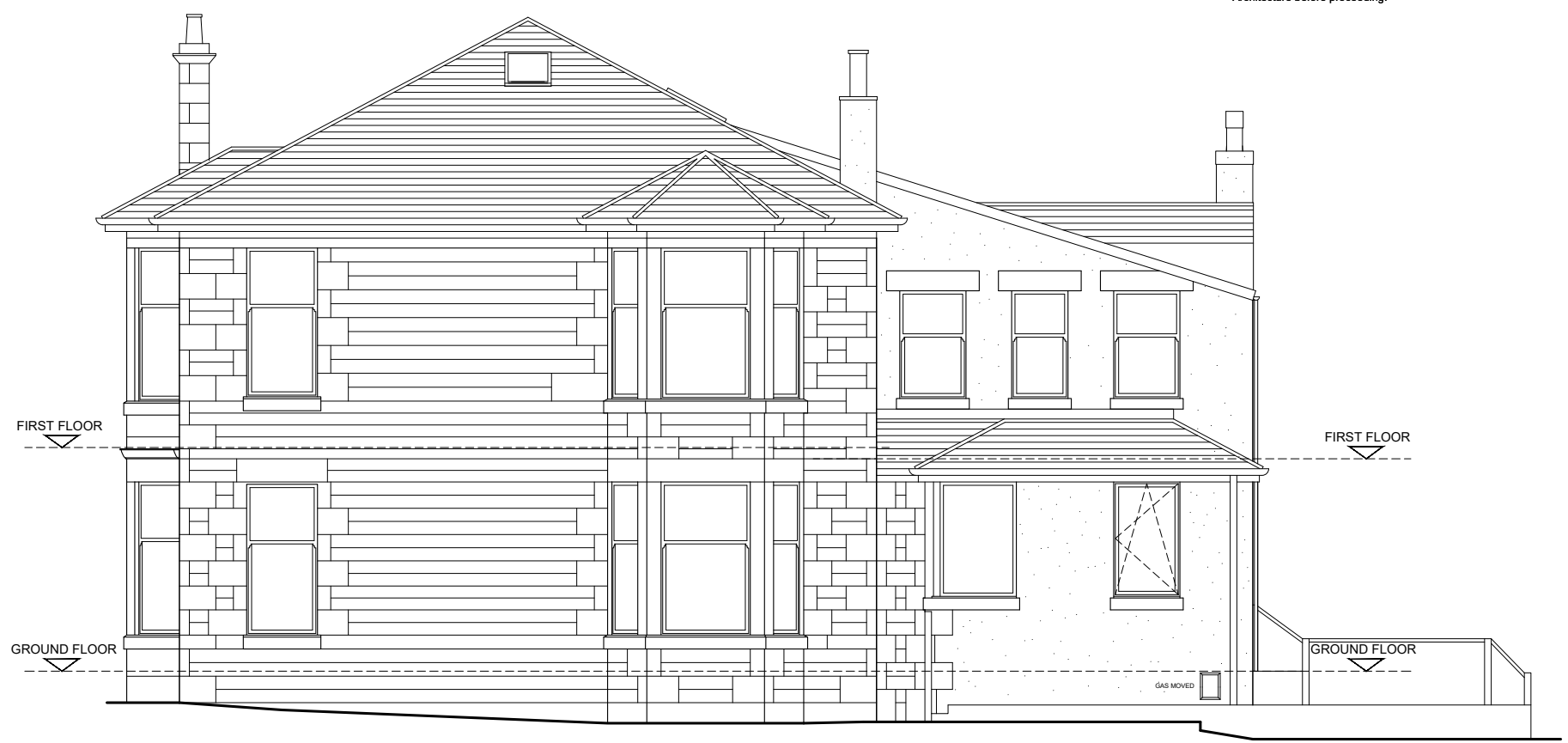
SIDE (WEST) ELEVATION AS PROPOSED