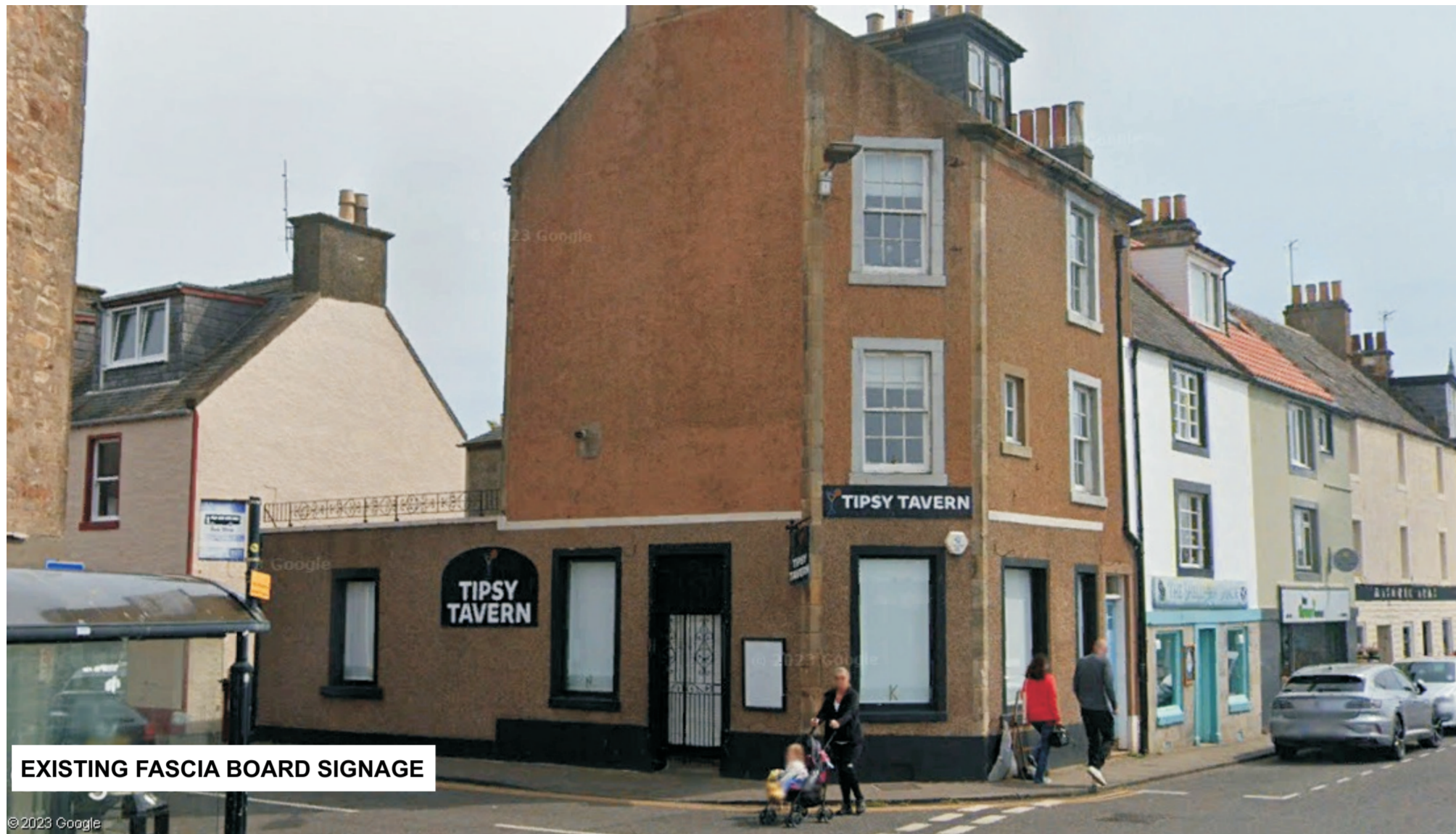
EXISTING FASCIA BOARD SIGNAGE