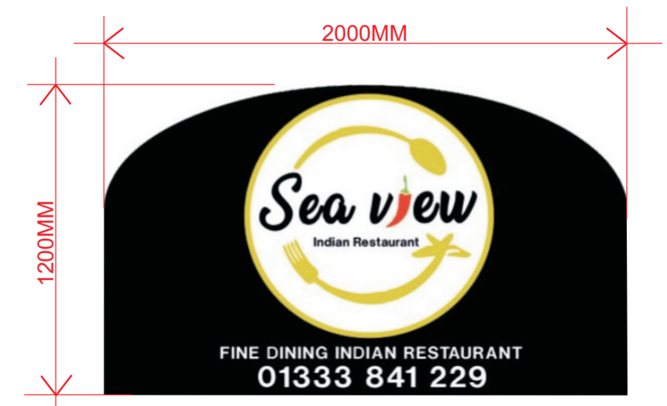
WEST ELEVATION FASCIA (NON ILLUMINATED) SC 1:20