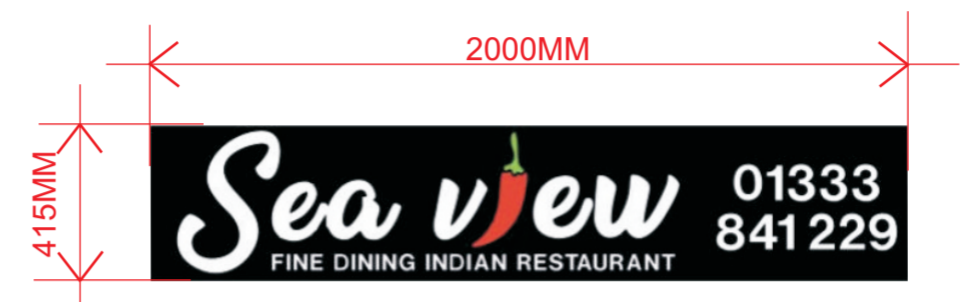
SOUTH ELEVATION FASCIA (NON ILLUMINATED) SC 1:20

EXISTING EXTERNAL SIGNAGE BOARDS RETAINED (FORMER TIPSY TAVERN). TO BE REPLACED WITH NEW VINYL LOGO GRAPHICS SIGNAGE ADVERTS ON THE WEST AND SOUTH ELEVATIONS. (EXISTING HANGING SIGN REMOVED).