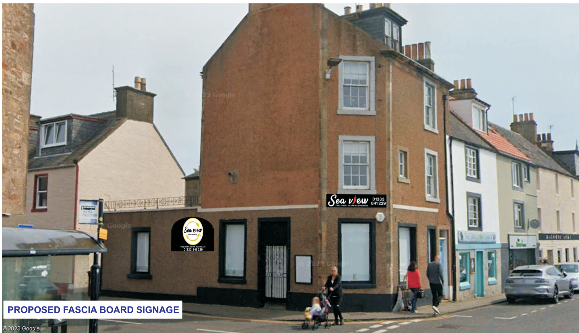
PROPOSED FASCIA BOARD SIGNAGE