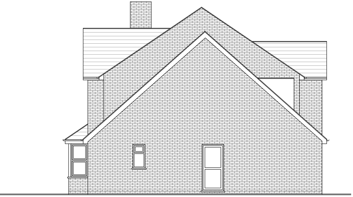
NO.7 EXISTING SIDE ELEVATION