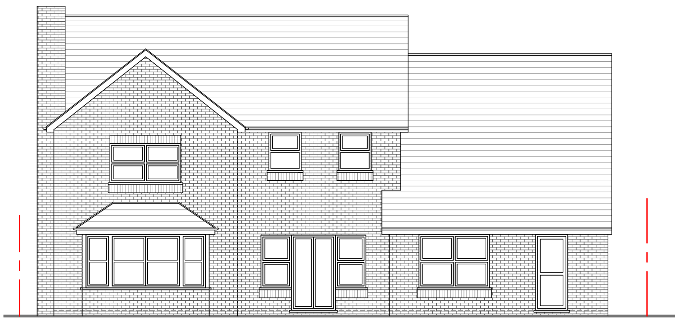
NO.7 EXISTING REAR ELEVATION