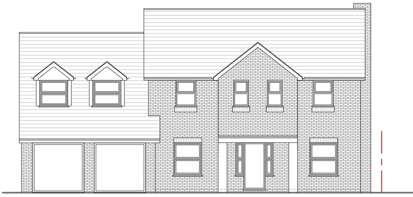
NO.7 EXISTING FRONT ELEVATION