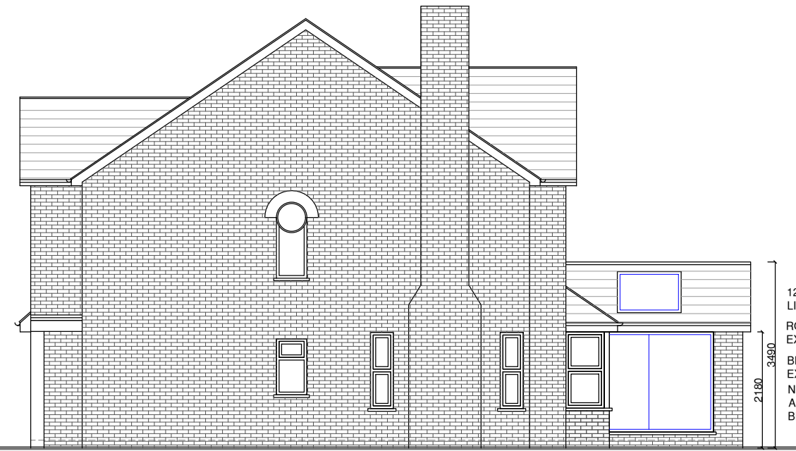
NO.7 PROPOSED SIDE ELEVATION

1200 X 1700MM ROOF LIGHTS ROOF TILE TO MATCH EXISTING ELEVATIONS. BRICK WORK TO MATCH EXISTING ELEVATION. NEW DOUBLE GLAZED ALUMINUM FRAMED BI- FOLDING DOORS