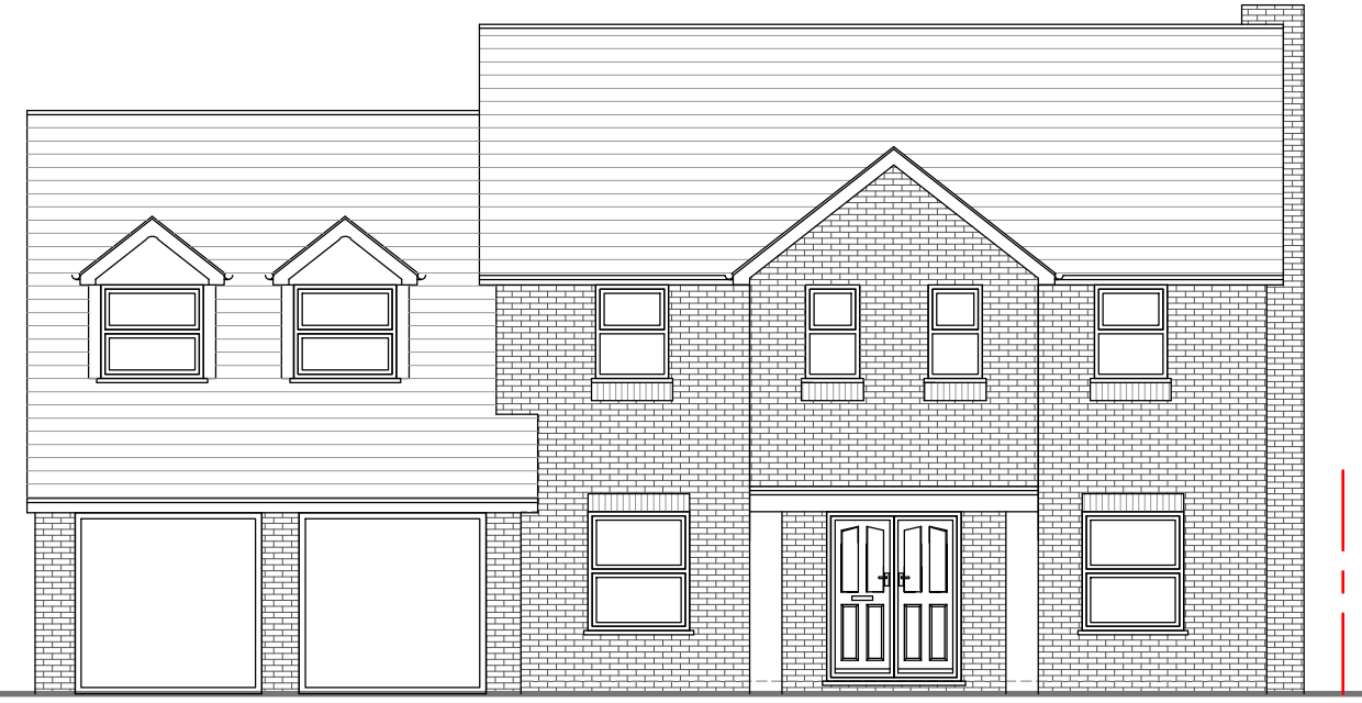
NO.7 PROPOSED FRONT ELEVATION