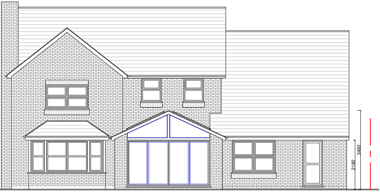
NO.7 PROPOSED REAR ELEVATION

1200 X 1700MM ROOF LIGHTS ROOF TILE TO MATCH EXISTING ELEVATIONS. BRICK WORK TO MATCH EXISTING ELEVATION. NEW DOUBLE GLAZED ALUMINUM FRAMED BI- FOLDING DOORS