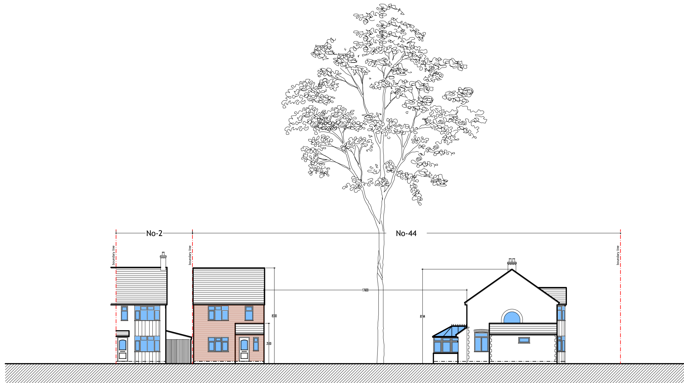
proposed street view