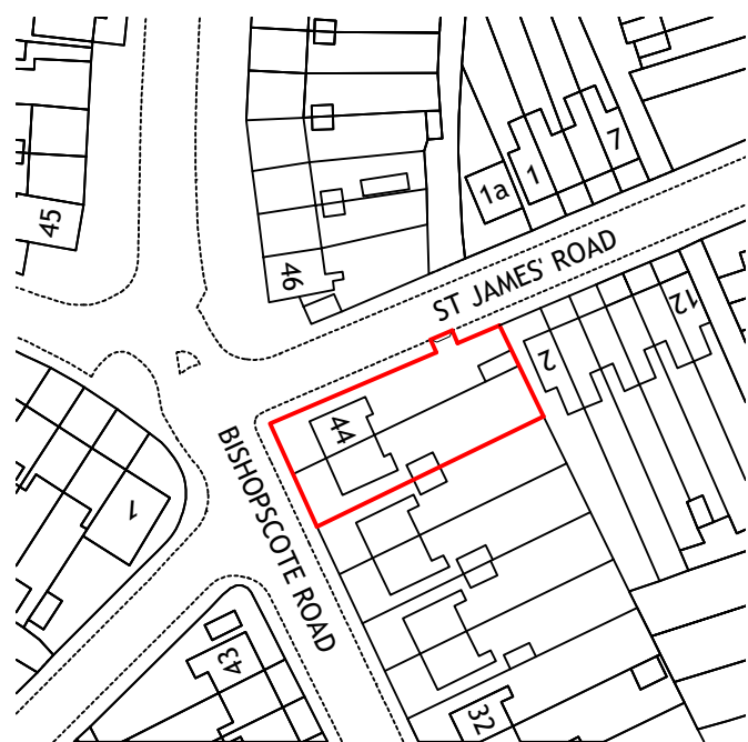
location plan scale 1:1250