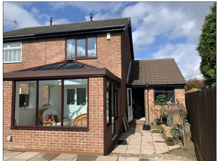
Photo 4 : Proposed single storey extension infills of set back of garage from rear of house.