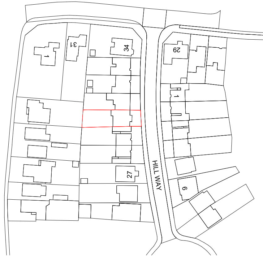
1 Location Plan 1 : 1250