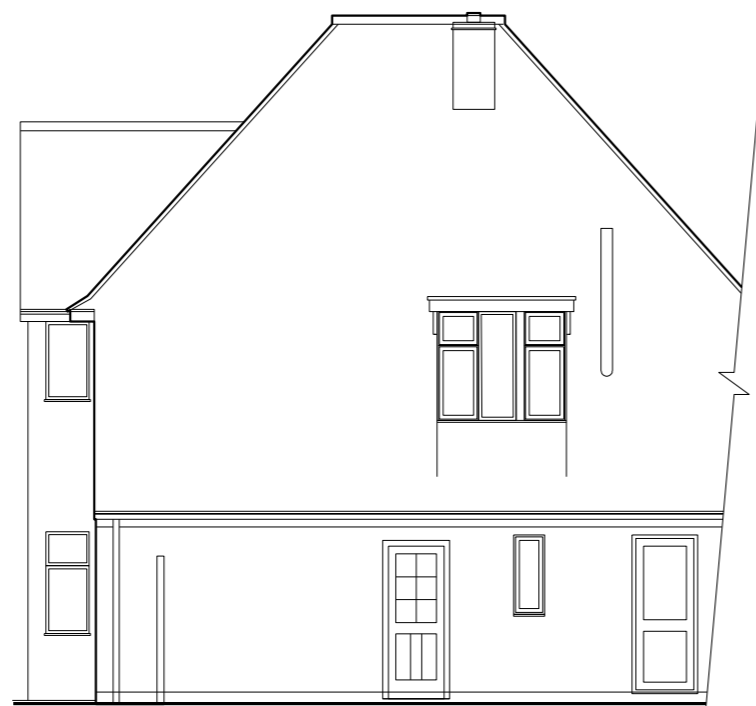
Existing Elevation B, Scale 1:100 @A2