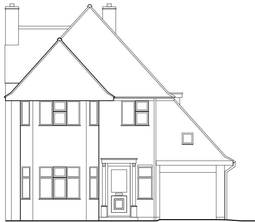
Existing Elevation A, Scale 1:100 @A2