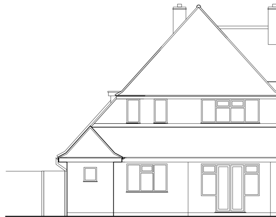
Existing Elevation C, Scale 1:100 @A2