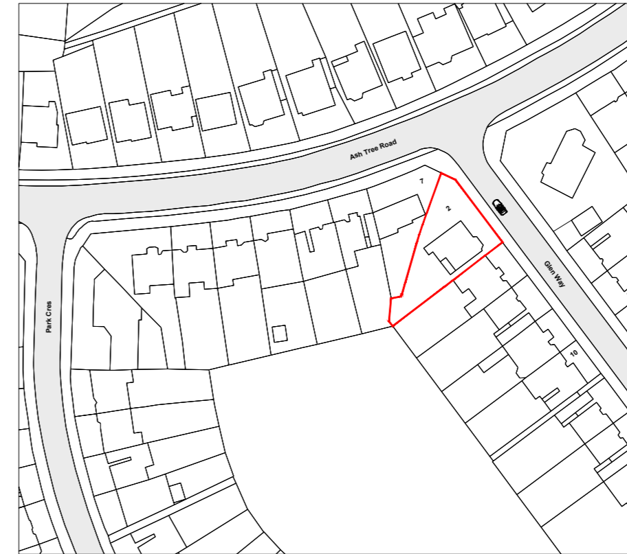
Location Plan, Scale 1:1250 @A2