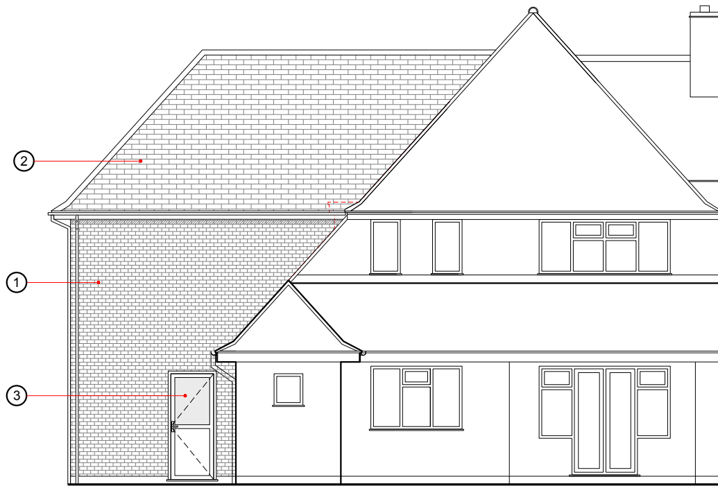
Proposed Elevation C, Scale 1:100 @A3