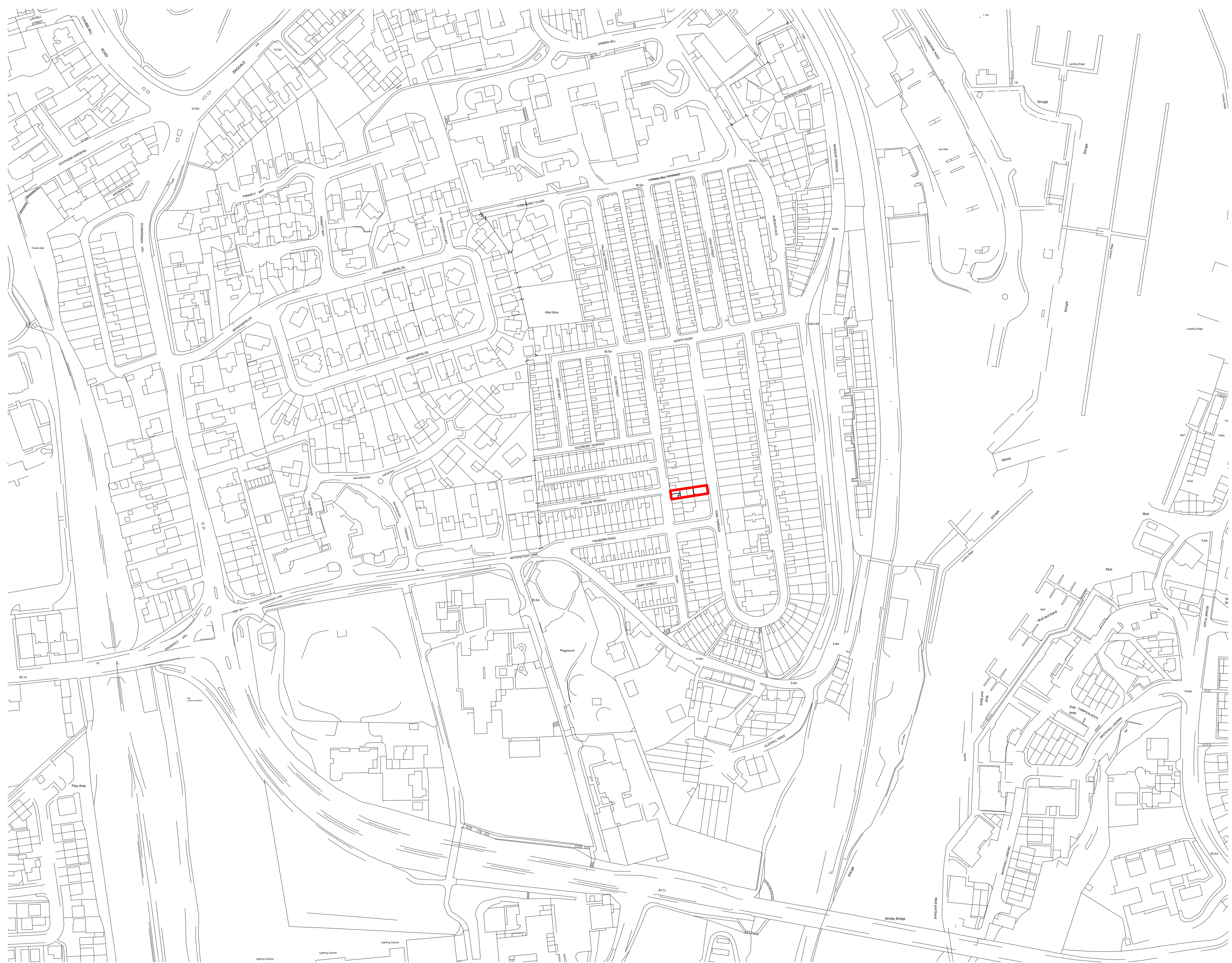
Existing Site Location Plan 1 : 1250

NOTE: Do not scale from drawing. A thorough site survey should be undertaken to obtain key dimensions and tolerances. If no dimension is given, it is the responsibility of the recipient to obtain the dimension specifically from the author or by site measurement. The sizing of all structural and service elements must always be checked against the relevant engineer's drawings. No reliance should be placed upon sizing information shown on this drawing. DRAWING PACKAGE FOR PLANNING PURPOSES ONLY. NOT FOR CONSTRUCTION OR TECHNICAL DESIGN.