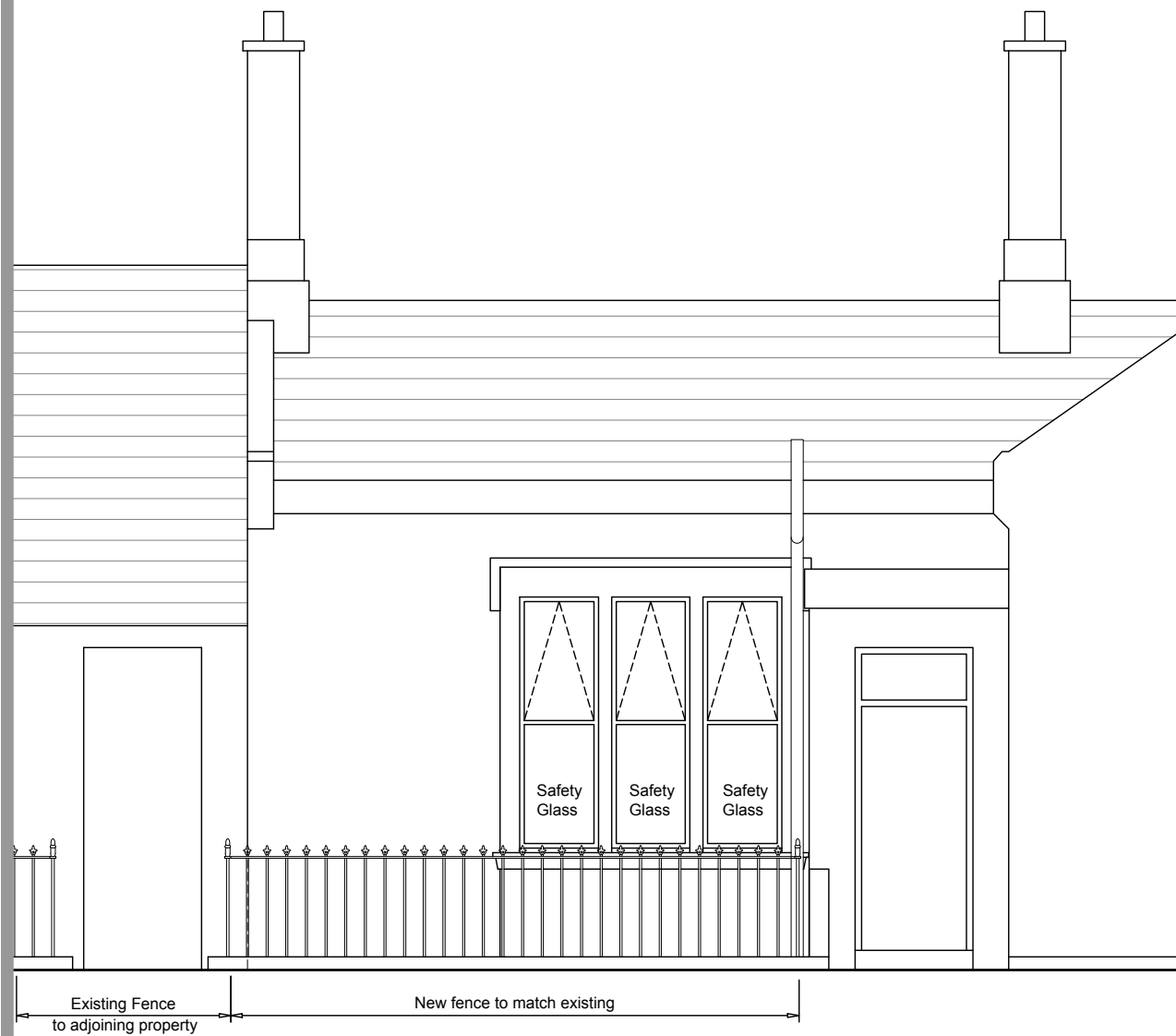
Proposed Elevation to Bath Place