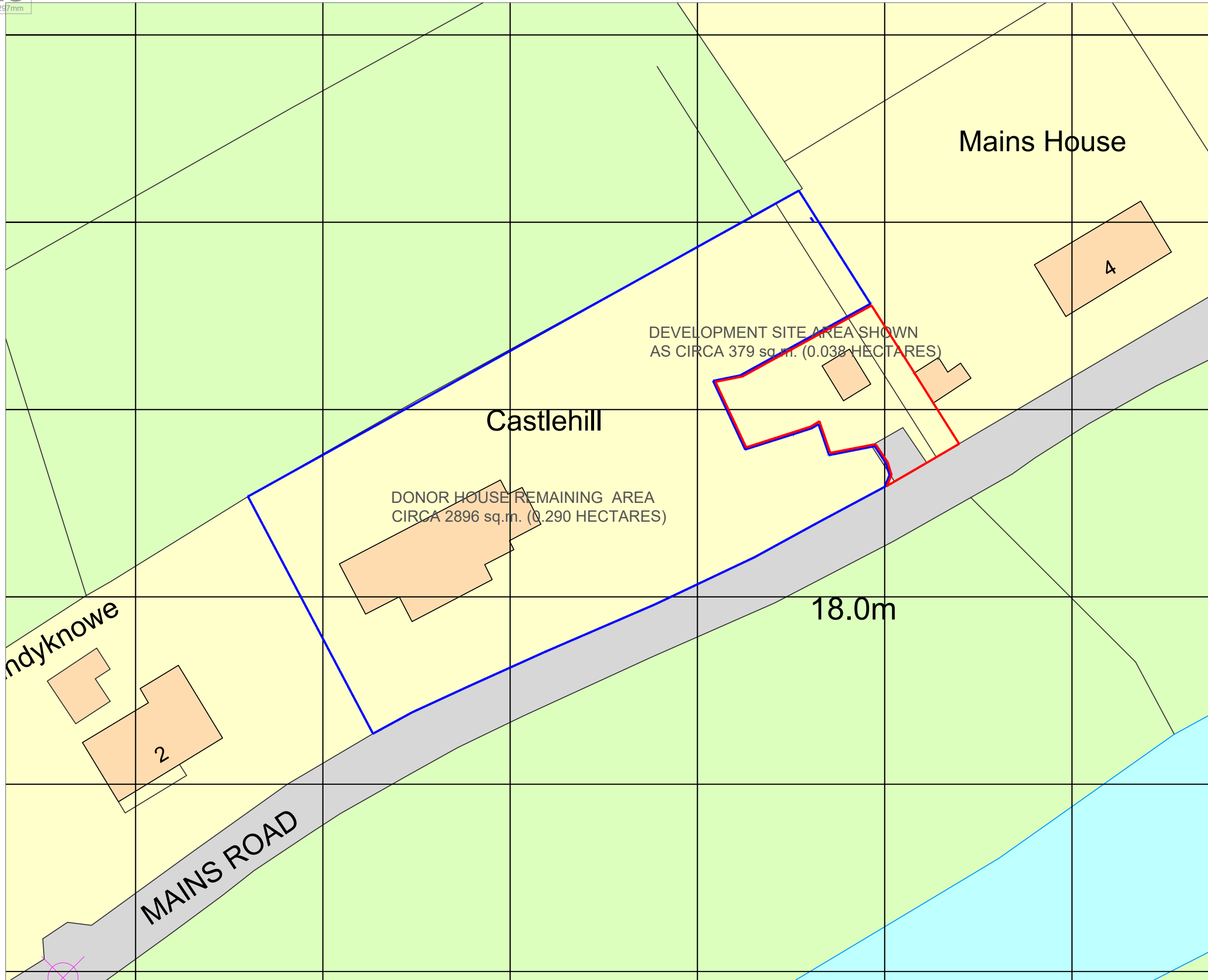
Site Plan 1:500

NOTES Internal dimensions are finished sizes unless otherwise stated.