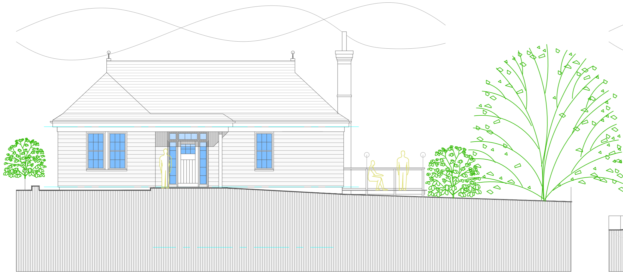
PROPOSED NORTH WEST ELEVATION