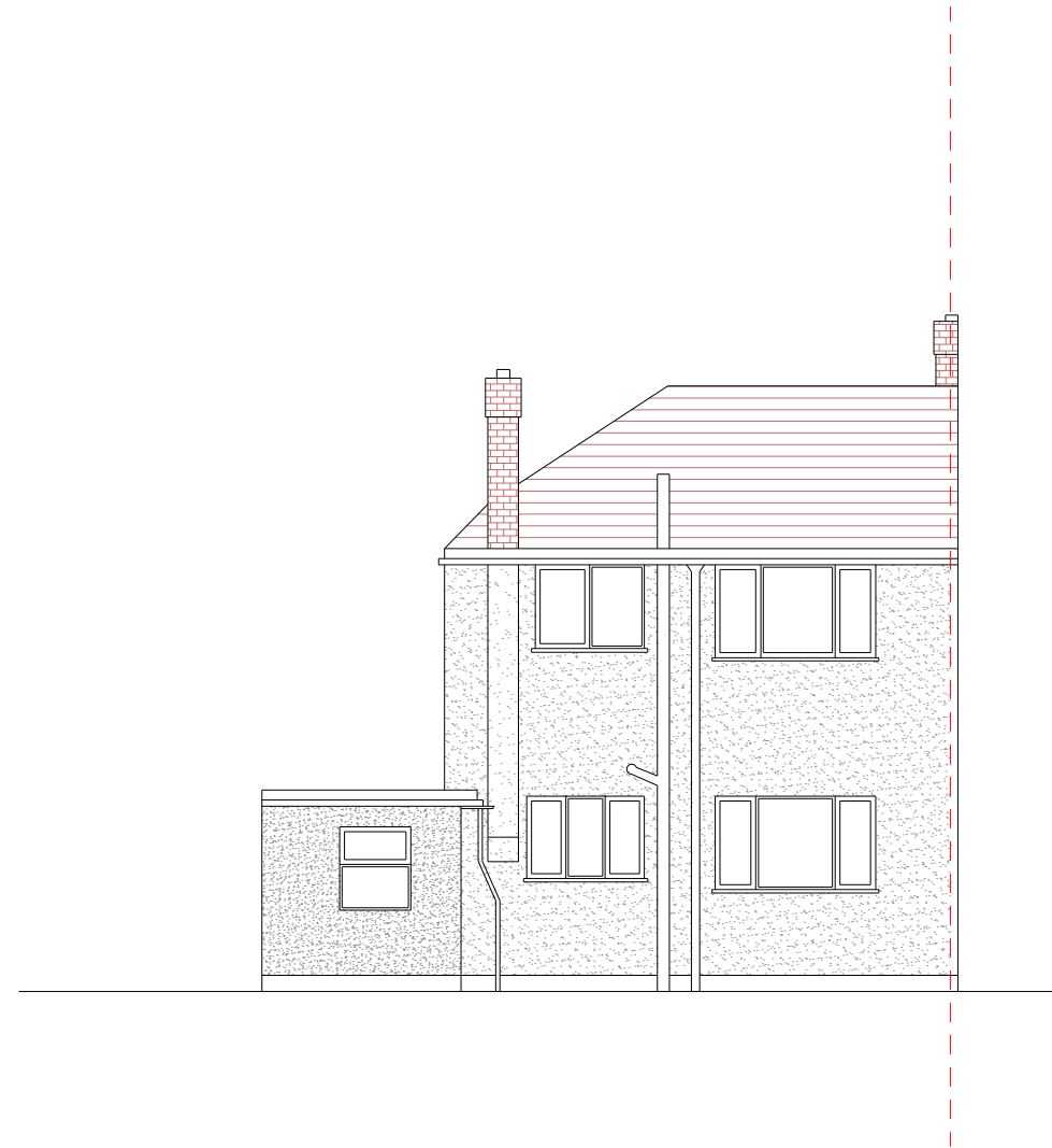
EXISTING REAR SIDE ELEVATION SCALE: 1:100