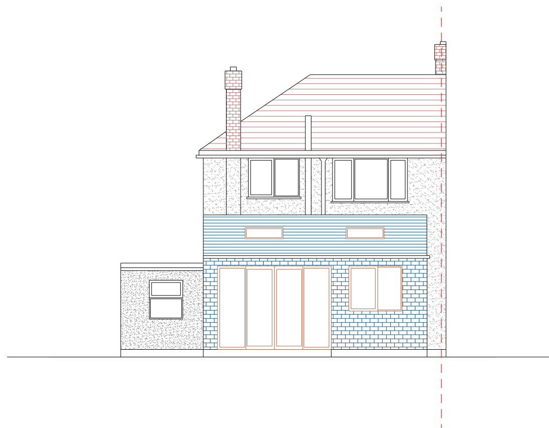
PROPOSED REAR SIDE ELEVATION SCALE: 1:100