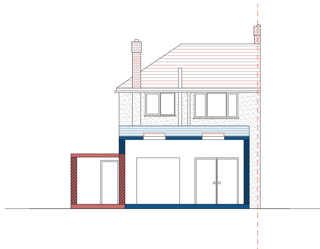
PROPOSED SECTION SCALE: 1:100