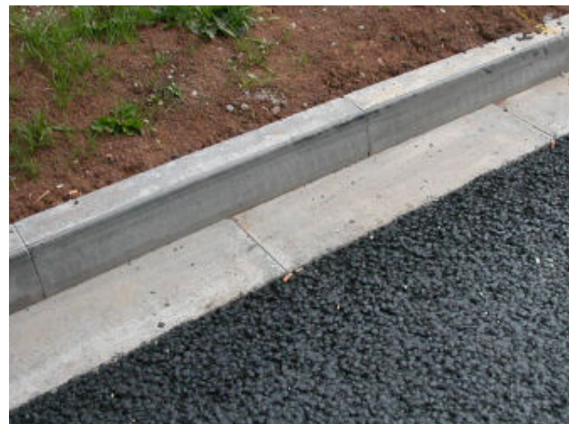
Bullnose concrete pavement Kerb - By Marshalls or equally approved.