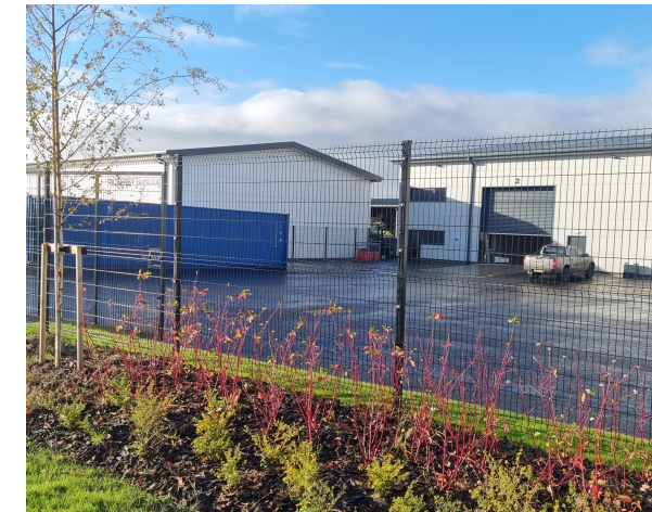
Fencing - Black Paladin mesh fencing