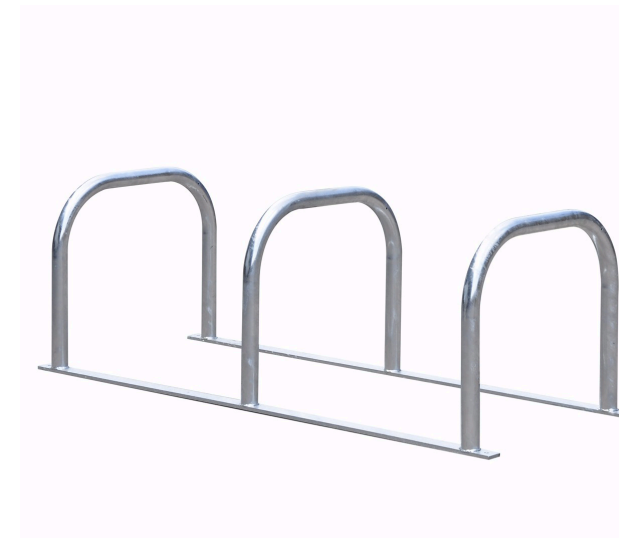
Sheffield Bike Rack - Zinc Powder Coated