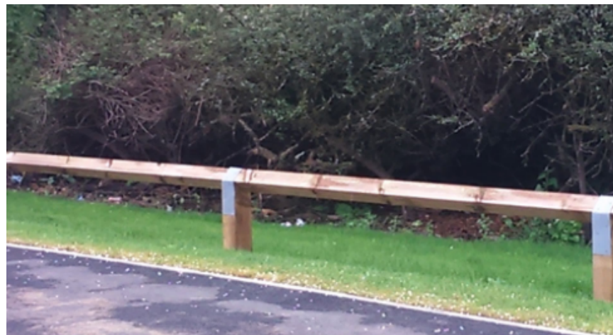
Timber Knee rail fence