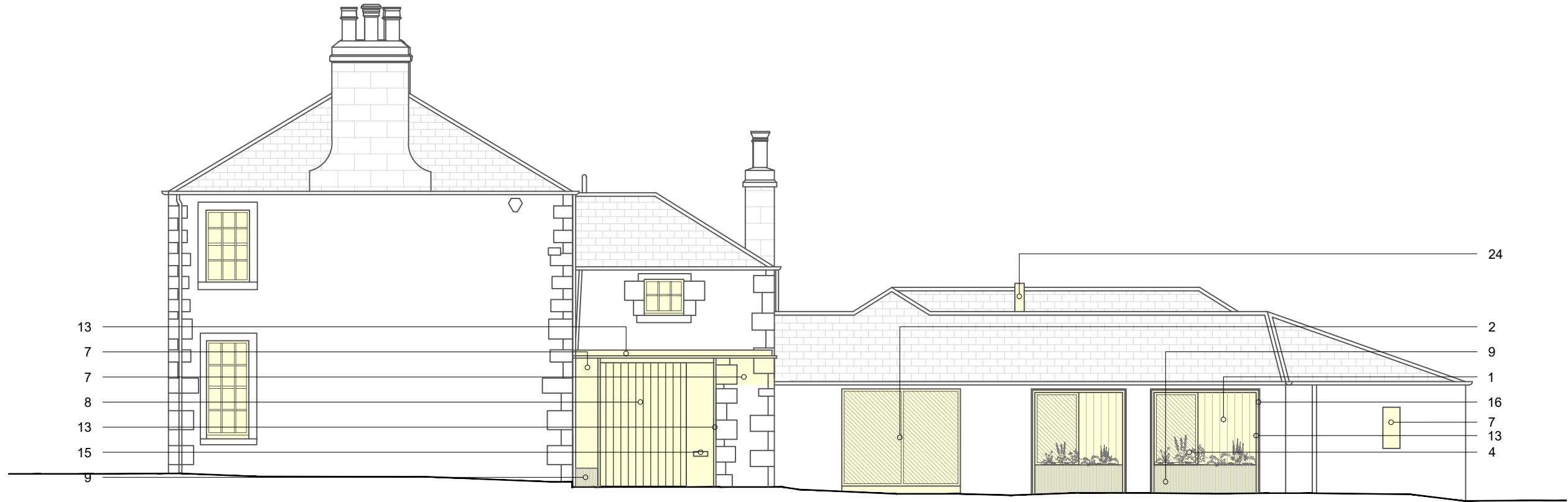
01 Proposed East Elevation 1:100