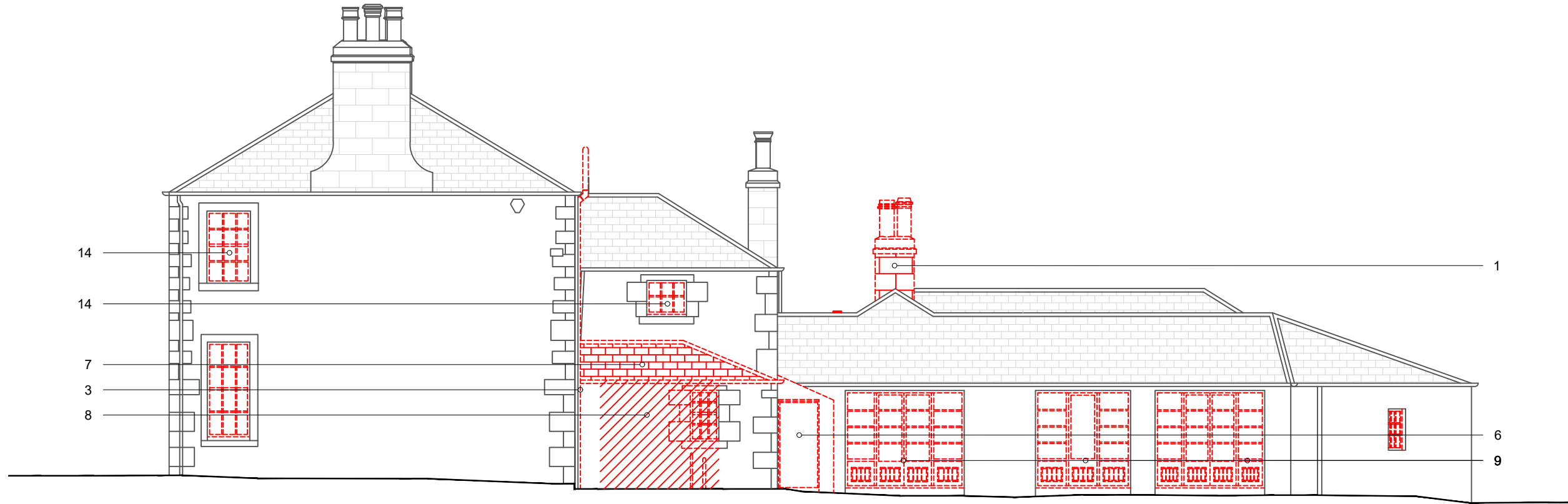
01 Existing East Elevation 1:100