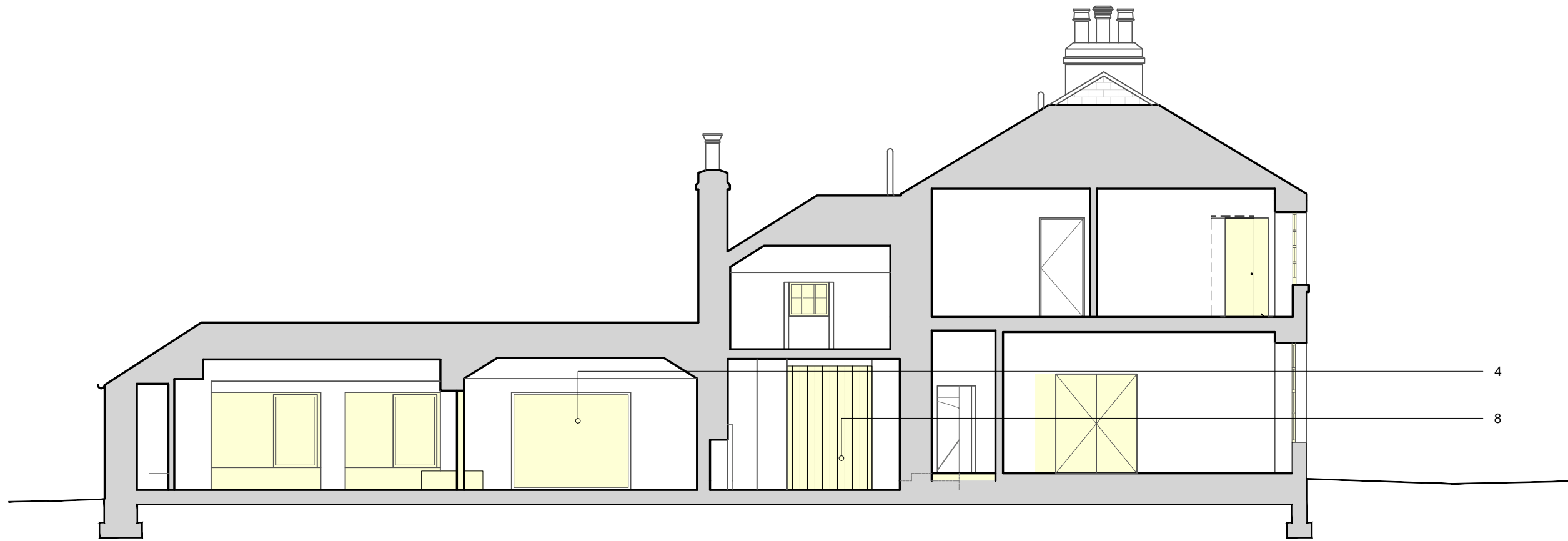
01 Proposed Section AA 1:100