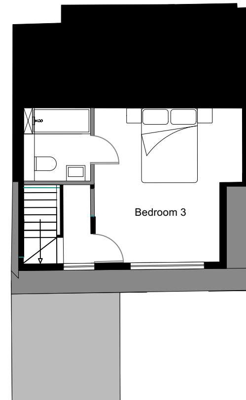
Proposed Second Floor Plan

Drawing Title: Proposed Front dwelling Floorplans Date: 06.07.2023 Drawing no: 1324-508 Scale: 1:100 @ A3 Drawn: NS