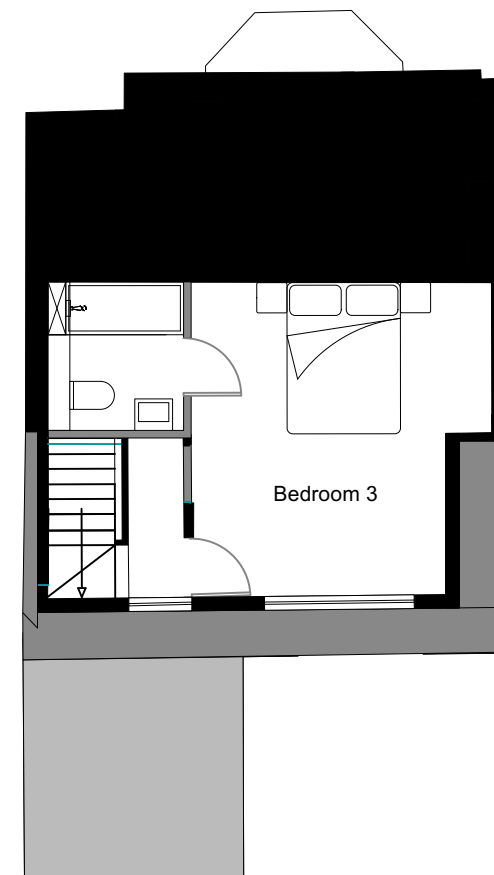
Proposed Second Floor Plan

Drawing Title: Proposed Front dwelling Floorplans Date: 06.07.2023 Drawing no: 1324-508 Scale: 1:100 @ A3 Drawn: NS