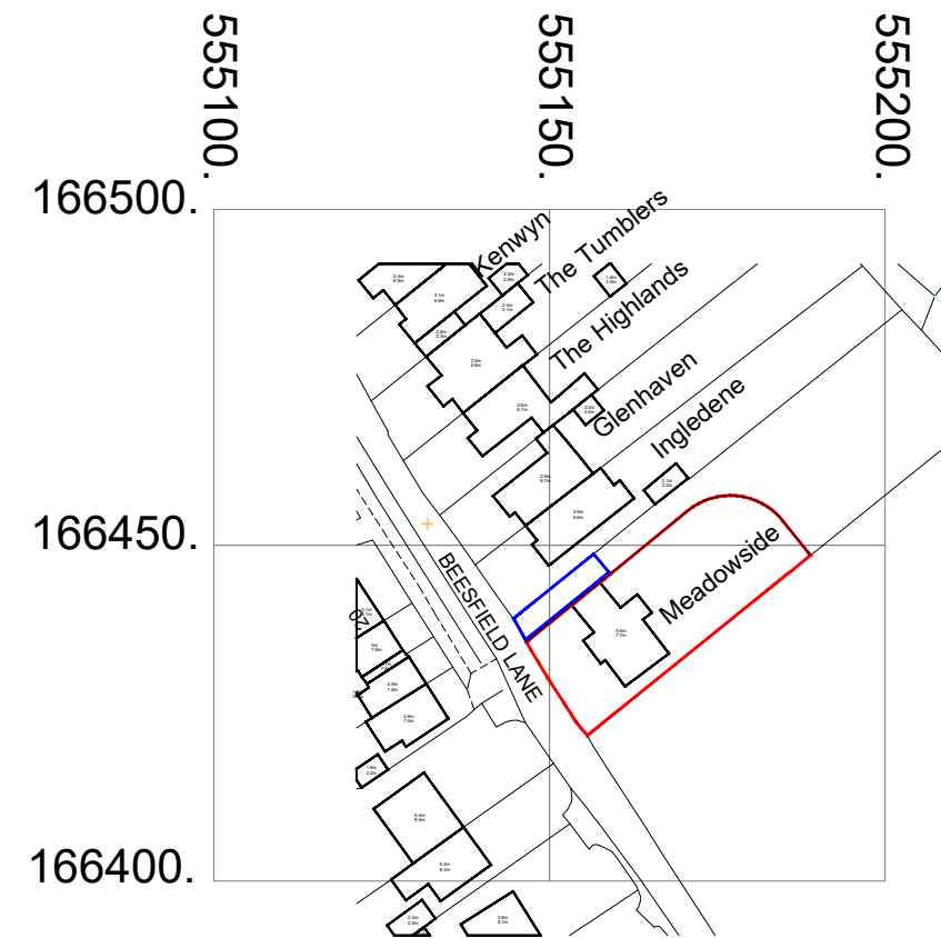
01 SITE/LOCATION PLAN SCALE 1:1250 @ A3