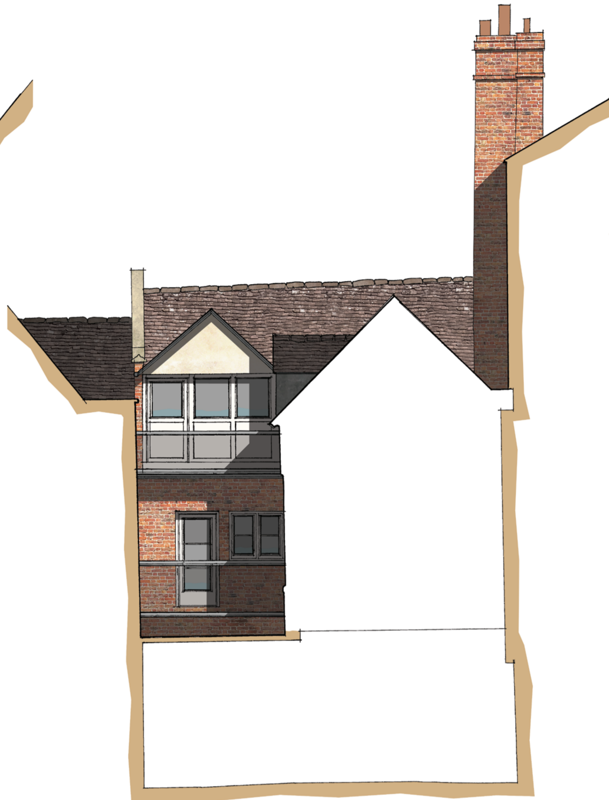
Inner North Elevation