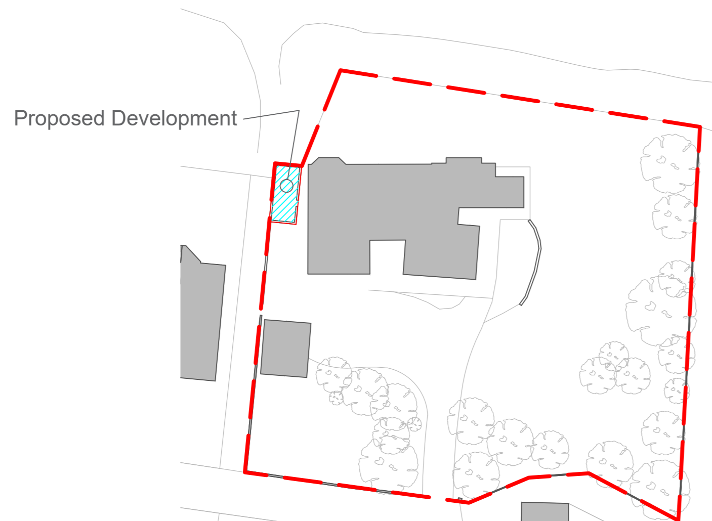
0 10m 20m 30m 40m 50m Scale 1:500 PROPOSED PLOT PLAN