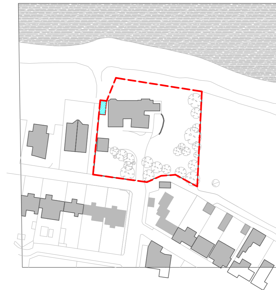
0 10m 20m 30m 40m 50m 100m Scale 1:1250 SITE LOCATION PLAN